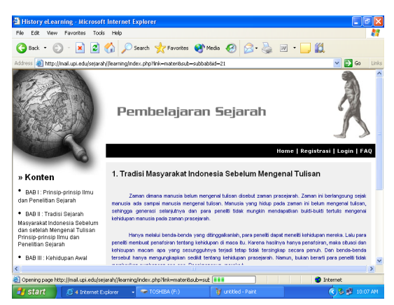
Learning Material Dsiplay