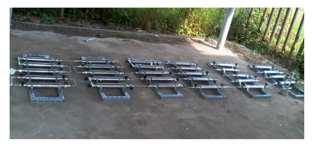
Figure 1. Arrangement of gas cyliders for preparation of PT samples.