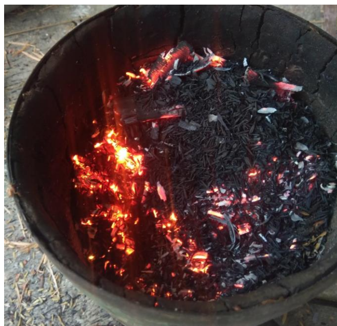
Figure 3. Coal from combustion

The first trial was with burning the rice husks on the stove that we had designed. The research purpose is to test whether the gasification stove can run properly marked with a blue flame. Burning rice husks will light up quickly if aided by the wind directed at the stove, as shown in Figure 3 . This is because the gasification process requires air to convert biomass into gas products. The air is needed in the oxidation process where there is a reaction between the rice husks and the results of the previous gasification process with oxygen (Pujotmo, 2017; Febriansyah et al. , 2013). The reaction is exothermic so that the heat generated by the gasification stove with rice husk as fuel can be used as a substitute for LPG. Therefore, the gasification stove design is not yet suitable for use, it still needs more improvements in the future.