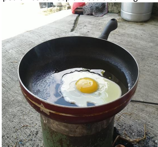
Figure 4. Experimental cooking with rice husk as fuel

The cooking experiment was carried out when the embers had formed and ignited. In this experiment, a chicken egg was used to check how long it took to burn it until the eggs were cooked. Once observed, the eggs are cooked within 5-6 minutes after the oil has heated up. The texture of the eggs is no different from when cooked using a normal gas stove. During cooking, the air is re-pumped twice to keep the coals burning.