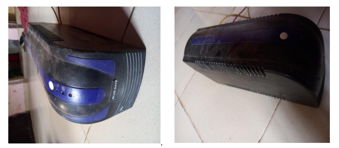
Figure 2. Casing of the inverter.

The use of an IC socket was employed to avoid any damages that might result from excessive heat while soldering the IC. The pin configuration of the IC used and its connectivity with other components on the board was strictly adhered to as shown on the design work before the socket was permanently soldered. In fact, the IC socket was the first item on the board while other components were placed around it ( Table 1 ).