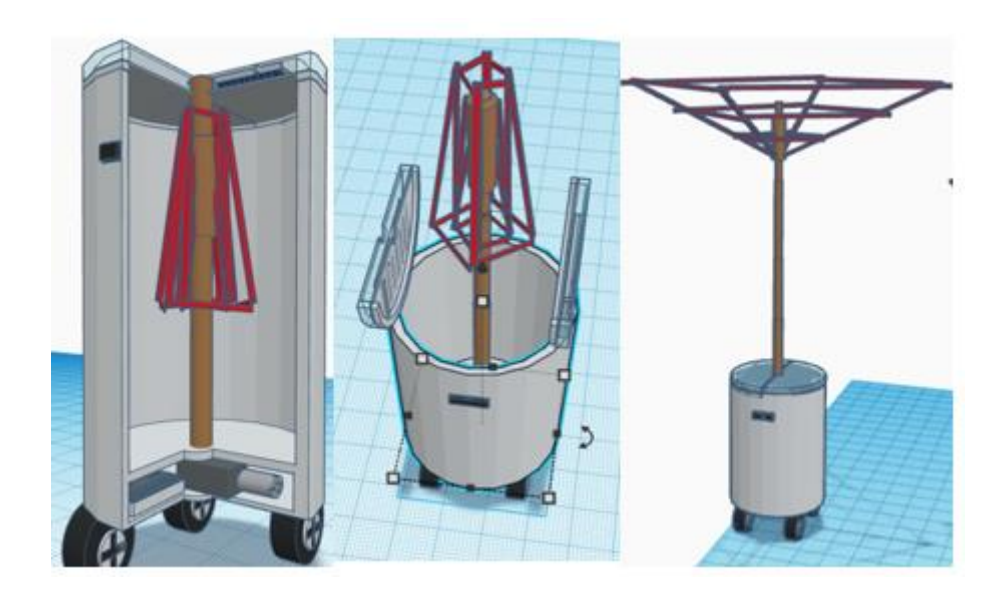
Figure 3. Show work simulation in the form of 3d model.