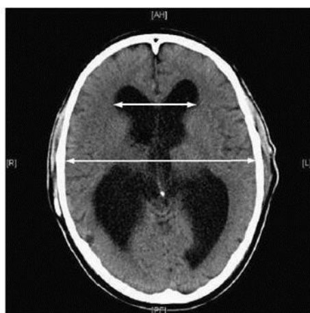
Figure 1. Measurement of ventriculomegaly on axial CT.

For methodology and intervention, upon arrival at the neurosurgery department through the emergency room or outpatient consultation, patients underwent a detailed neurological interview and physical examination. This was complemented by fundus examination and imaging studies. Based on these elements, patients were either hospitalized for urgent neuroendoscopic surgery, depending on their neurological condition, or, if feasible, elective surgical treatment was planned. Using computed tomography (CT) images, the dilation of the lateral and third ventricles was determined. The EVANS index ( Figure 1 ) was calculated, which involves the greater diameter of the frontal horns of the lateral ventricles and the greater biparietal diameter being more than 30% of the diameter of the third ventricle. The degree of hydrocephalus was assessed using the Marlon scale ( Figure 2 ), considering the presence of the temporal horns of the lateral ventricles, trans ependymal flow, decreased subarachnoid space, and other imaging elements indicating obstructive hydrocephalus. Furthermore, this imaging study also aided in diagnosing the possible etiological cause of obstructive hydrocephalus.