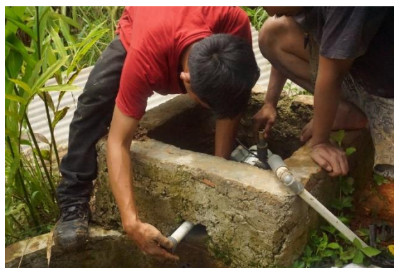
Figure 5. Install The Water Pump