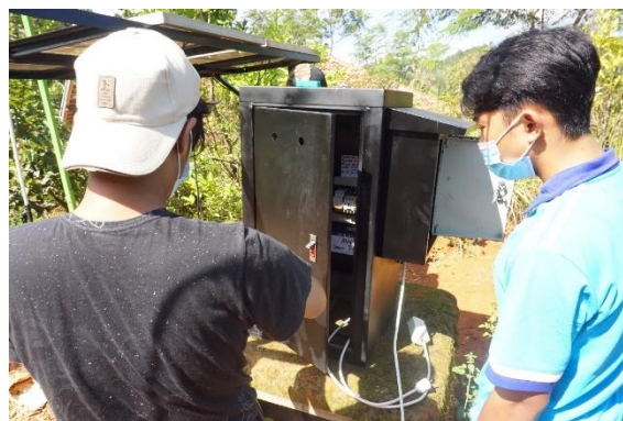
Figure 4. Install The Controlling System