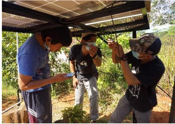
Figure 2. Install The Solar Panel

The system has been implemented in Sirnajaya Village, the documentation can be seen in the figures.