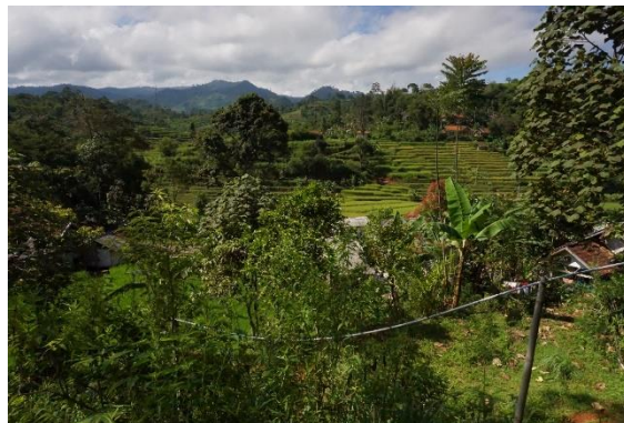
Figure 3. Install The Water Pipe