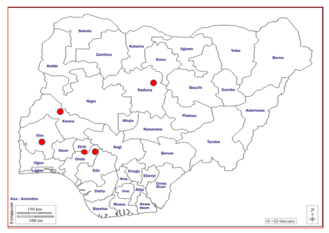
Figure 1. The Map of Locations of the used in this study.

In this study, we monitored AQI, pollutants (PM2.5, PM10, CO, NO2, NO, and SO2), and meteorological parameters with a high temporal resolution for Nigeria, which was obtained from the Air Quality Monitoring Network of eWeather HDF app from 17 October 2021 to 31 October 2021 (see Figure 1 ). The weather app and widget provide accurate hourly and 10-day weather forecasts from two weather providers. The weather report from the weather forecast includes temperature, humidity, rainfall and new snowfall amount, wind speed, and dew points graphs. eWeather HDF app collects location data to display the current weather for the current location in the status bar and widgets, even when the app is closed or not in use. All app information is also available with various weather widgets and status bar notifications. All measurements were taken in triplicate and statistically analyzed in Excel 2013.