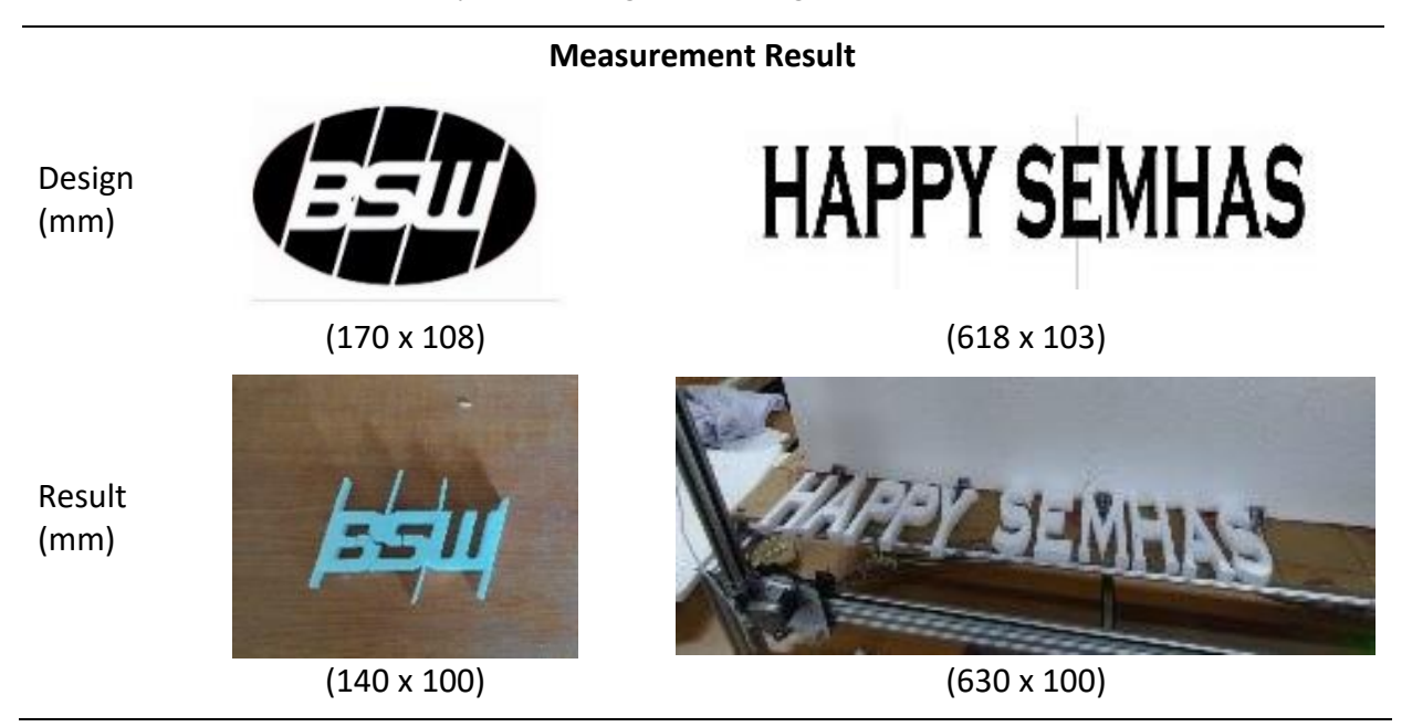
Table 5. Styrofoam Design and Cutting Measurement Result.