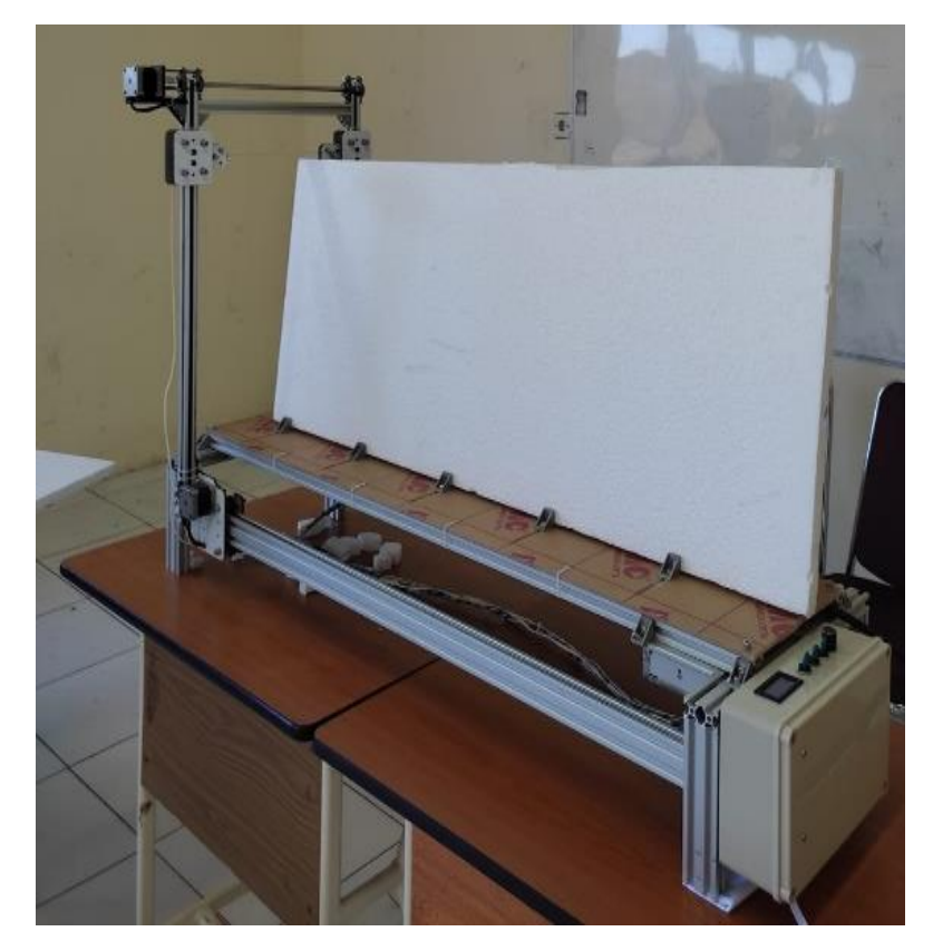
Figure 1. CNC2 Axis Based Styrofoam Cutting Machine Using Hot Wire.

The research involved in developing this CNC-based Styrofoam cutting machine employs a comprehensive range of experimental methods to ensure its successful creation. Through meticulous design, manufacturing, assembly, and testing processes, the researchers have dedicated themselves to perfecting every aspect of the machine. Their unwavering commitment to excellence and relentless pursuit of innovation have resulted in a remarkable technological advancement that promises to revolutionize the way Styrofoam is cut and shaped. The styrofoam cutting machine can be seen in Figure 1 .