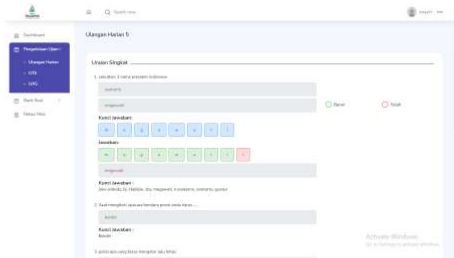
Figure 4. Integration of the Jaro-Winkler Algorithm in the Admin Question Bank Module