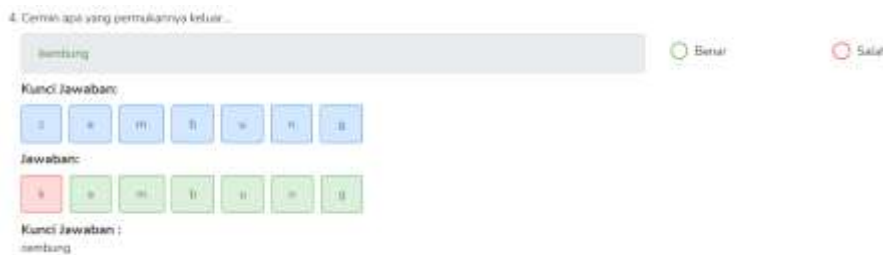
Figure 5. Real-time Jaro-Winkler Similarity Calculation during the Grading Process

The core functionality of the system involves comparing student submissions against the stored "Gold Standard" keys. Figure 5 illustrates the system's ability to calculate similarity scores in real-time. During this phase, unit testing confirmed that the system correctly applied case-folding (e.g., converting "cembung" and "kembang" to a common format) to avoid unnecessary grading penalties.