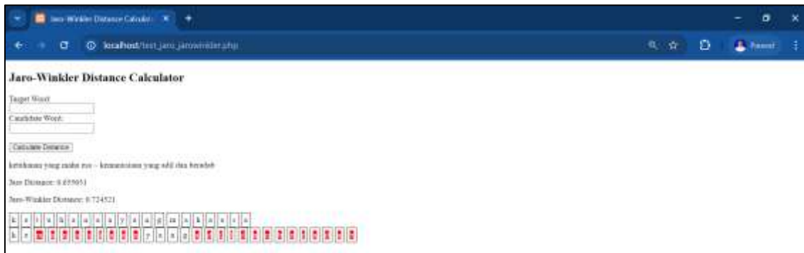
Figure 3. Standalone Prototype of the Jaro-Winkler Distance Calculator used for algorithmic verification during the Elaboration phase.