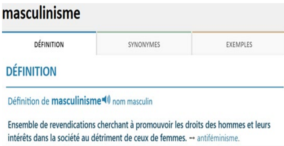
Image 1. Example of word information presentation in the online LPR Dictionary

For example, LPR defines masculinisme as 'a set of claims aimed at promoting men's rights and interests in society, to the detriment of women's rights.' Meanwhile, LRS presents a definition with similar meaning but far greater detail: 'An ideology originating in North America, grouping together a myriad of movements mostly present online, in reaction to a feminist movement that they claim to be victimized by, and under the guise of denouncing all forms of discrimination, which spreads sexist, conspiratorial, and reactionary ideas through a well-structured misogynistic and/or patriarchal discourse.' The comparison of these definitions can be seen in Image 1 and Image 2 below.