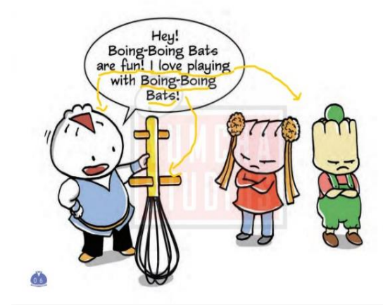
Figure 8 Bao claiming that he loves playing with the bat

More about the discovery, the result also shows several instances from the other types. Figure 7-9 contains a couple of excerpts taken from both Book 1 and Book 2.