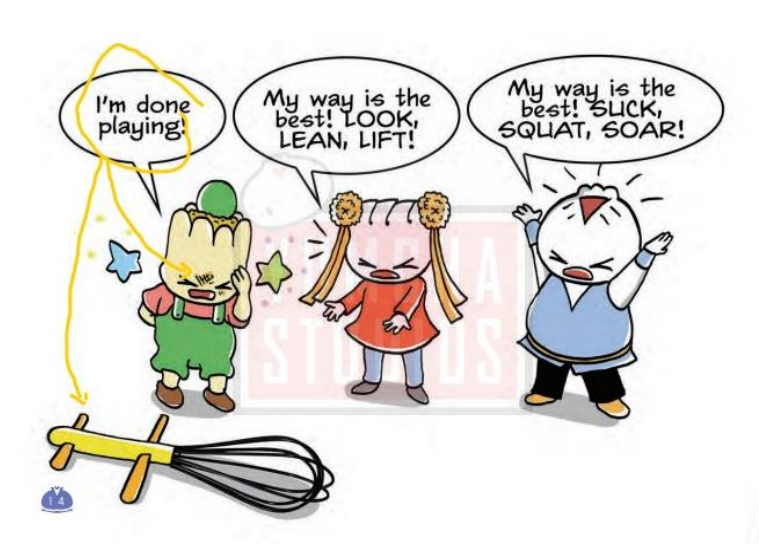
Figure 6 Collocation in Book 2

Figure 6 depicts a collocation specifically between the gesture or expression of the characters and a specific part of the dialogue. There we can see how I'm done playing is being reinforced by the wince on Shaomai's face, the bruise on his forehead, and the Boing-Boing Bats which is laying on the ground in front of him. It encourages young readers to thread the meaning between Shaomai getting hurt from falling off of the bats and his utterance that he