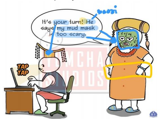
Figure 2 Instances in the Book 1 for repetition and collocation.

Figure 2 is a sample comic page taken from Book 1 in which the story revolves around bedtime. In this instance, we can see Papa and Mama are in comfortable wear, which is commonly associated with sleep attire. To add to the characterization, each participant has a headpiece on to indicate the Chinese background culture. Also, Mama has a rather striking feature on her face, a mud mask, which is indicated using a blue square in the annotation. The arrows from the verbal texts mud mask and too scary map onto the visual images, that is the green and slimy-looking mud mask. Each of the phrases has its meaning-making relation with the represented visual. The phrase mud mask is directly represented in the visual, thus this fall into an instance of repetition. The phrase too scary,