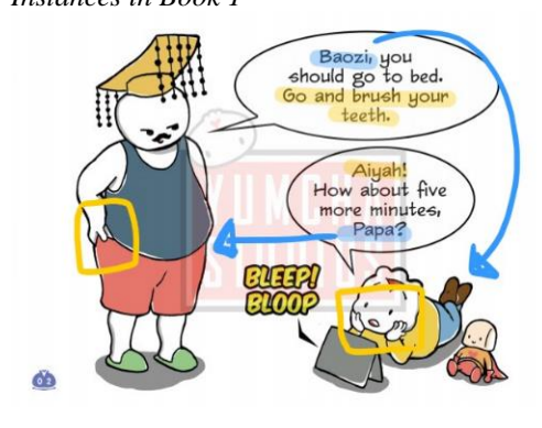
Figure 3 Instances in Book 1

however, is considered as an instance of collocation since it is an inferred meaning of the slimy-looking mud mask. Both instances provide both the idea of the word 'mud mask' and what is highly expected to co-occur with the word-which, in this particular context, is fear or scary . Another interesting part that may be pointed out while reading the book out loud with children is that we may also motivate the young readers to look up the association of both mud mask and bedtime routine; especially, since the entire book setting happened around bedtime. It can also be seen that the participants in the scene that are verbally represented using he and your are mapped onto the visual images as indicated by the arrows.