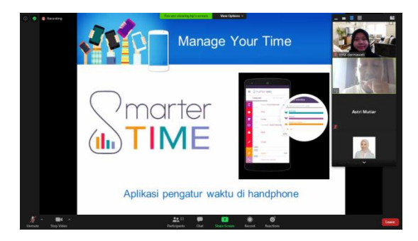
Figure 1. Video Conference Self management application program in increasing the productivity of adolescents at risk of HIV/Aids

The program is carried out in accordance with the planned flow of stages, and several modifications of learning techniques through video conferencing are carried out in relation to the Covid-19 pandemic.