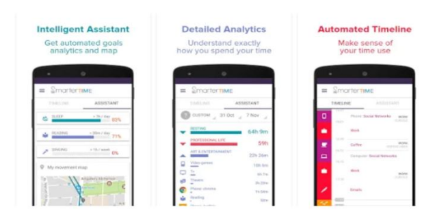
Figure 2. Smarter Time Application

The output of the program is achieved by increasing the soft skills of adolescents against HIV transmission and the application of the Smarter Time mobile-phone app: a simple, inexpensive and effective time management that can be used to increase adolescent productivity and prevent risky behavior against HIV transmission.