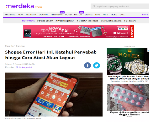
Figure 1. Shopee Error News

The problem was discovered from 6 to 8 February 2023 with the news that Shopee had an error. Based on the article Anggraini (2023) In picture 1 the words "Shopee error" became a trending topic on social media Twitter until 11.18 WIB with a total of 57 thousand tweets.