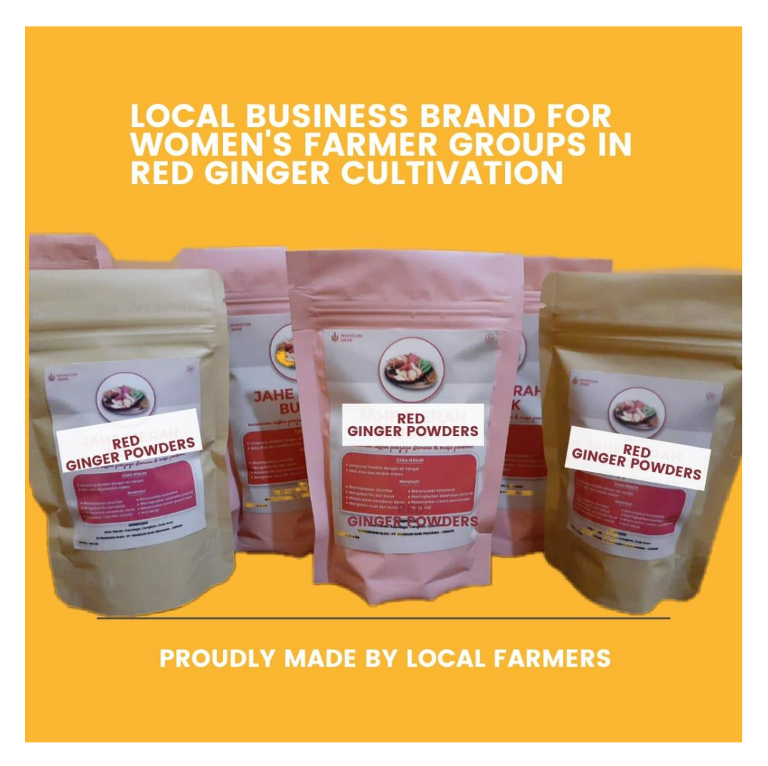
Figure 3. Farmers' group products in the development of red ginger herbs amid the covid-19 pandemic.