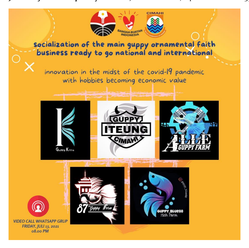
Figure 4 Publication of ornamental fish business innovation development as potential economic circulation.