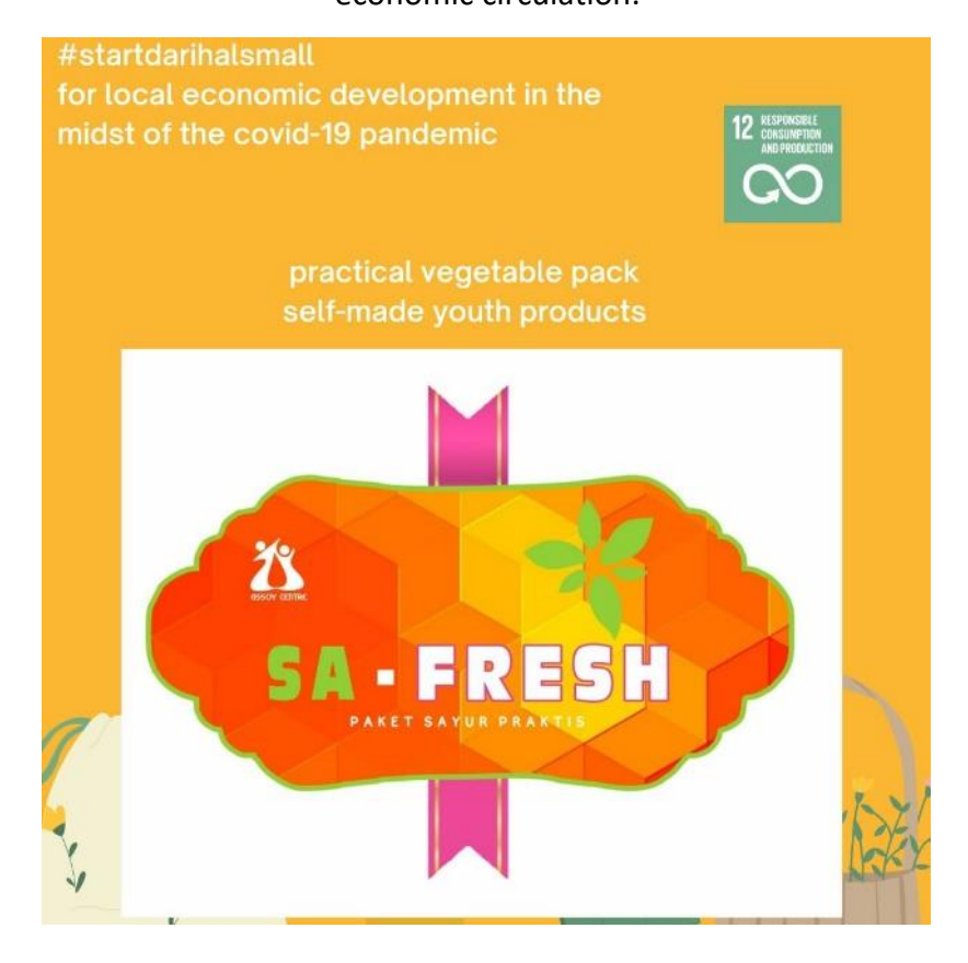
Figure 5. Product Products Brand Organic Vegetables and Organic Fertilizer IPKAM Farm.