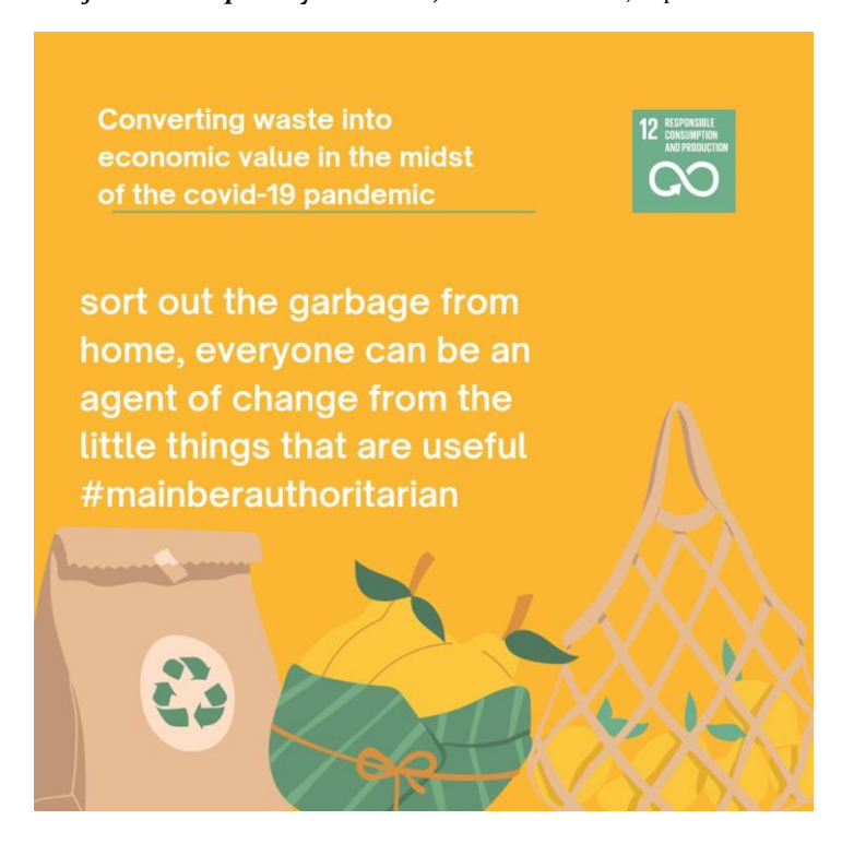
Figure 2. Community-based local potential innovation strengthening activities with sehati community.