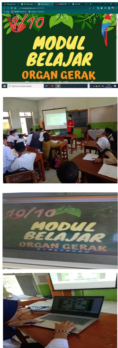
Figure 5 Implementation of the Canva and Liveworksheet-based E-Module on Animal Movement Organs