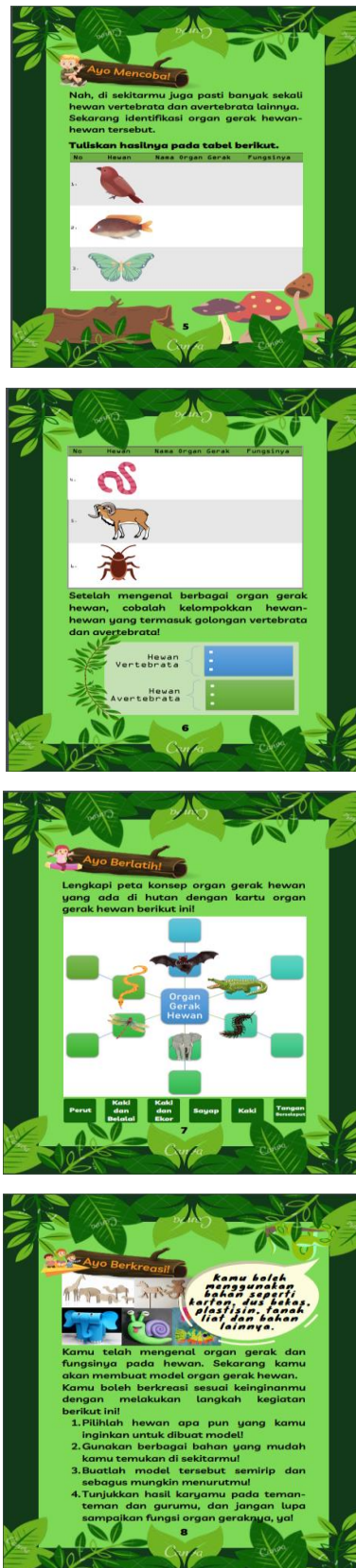
Figure 4 Content of the Canva and Liveworksheet-based E-Module

The content of this Canva and Liveworksheet-based E-Module is designed