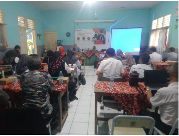
Figure 1. Resource persons for community service

Based on the results of the service interview with participants in the MGMP SOCIAL STUDIES activities, the unavailability of integrating disaster literacy in social studies subjects in the education sector (in this case learning tools include worksheets, textbooks, assessment instruments, and learning media) is the most important reason for carrying out community service activities. Technical training in empowering social studies teachers in the form of providing knowledge about mapping and integrating disaster literacy in learning through learning tools made by teachers.