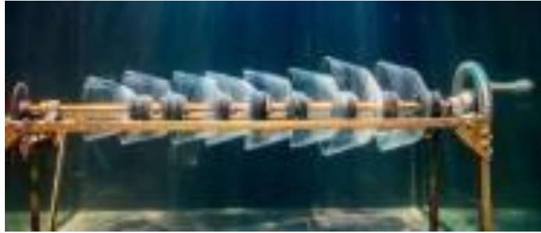
Figure 2. Crystallophone

The crystallophone, or glass armonica as it is more commonly called, is a spinning instrument that uses a series of glass vessels of graduated sizes to produce musical tones through friction. Usually played with fingers rubbing against the rim of the bowl, the crystallophone produces the most delicate and soft sound. Originally invented by Benjamin Franklin in 1761, then MIT software developer and inventor Andy Cavatorta re-engineered its structure and acoustic properties to work in our underwater environment.