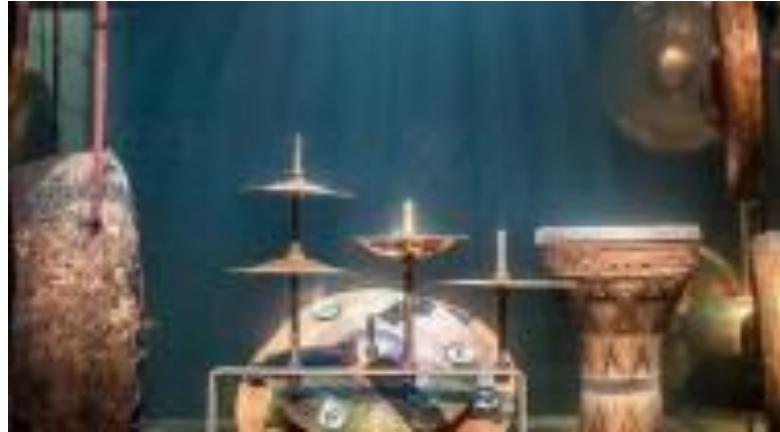
Figure 6. Percussion

Percussion instruments play an important role in Between Sonic's compositions for Aquasonic, such as Bell plates, gongs, triangles, darbouka, and many others (Soares, et al. , 2021). However, when played underwater, percussion instruments become very unstable, their pitch and timbre often changing and sometimes differing from session to session. In collaboration with former electronics engineer turned instrument maker Matt Nolan from the UK, they have developed a series of percussion instruments that are specially tuned to be more predictable and expressive. Together with acoustic experts, they have measured the exact placement of each instrument in the tank, to get the same sound every time.