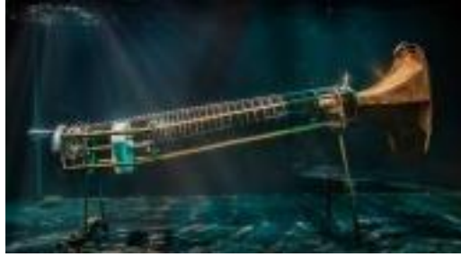
Figure 4. Rotacorda

Between Music commissioned MIT inventor Andy Cavatorta to create a custom stringed instrument adapted from the old hurdy gurdy. They named it Rotacorda, a combination of the Latin word rota for wheel and the Italian word corda for string. It produces sound with a wheel that cranks and rubs against the strings. The wheel functions like a violin bow, and single notes played on the instrument sound similar to a violin. Between Music has developed it further by adding brass horns from old gramophones and experimenting with many different strings and stands to make the sound as warm and stable as possible.