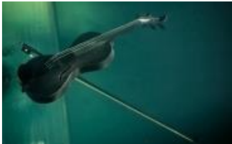
Figure 5. Carbon Violin

Initially, Between Music started experimenting underwater with very cheap and poor quality violins. The violin lasted for three days of testing underwater and then disintegrated. The glue was water-soluble, so it was no surprise. They knew violins were sometimes made of carbon fiber (Forintos & Czigany, 2019), so they wrote to all the carbon fiber violin makers in the world and finally chose the German company Mezzo-Forte. It has been experimenting and redesigning classical stringed instruments for the past eight years and specifically made their violins to be able to be played safely underwater for long periods of time. They use carbon fiber bows with synthetic hair, and are currently developing a new type of rosin for underwater use, together with Australian rosin manufacturer Leatherwood Bespoke Rosin.