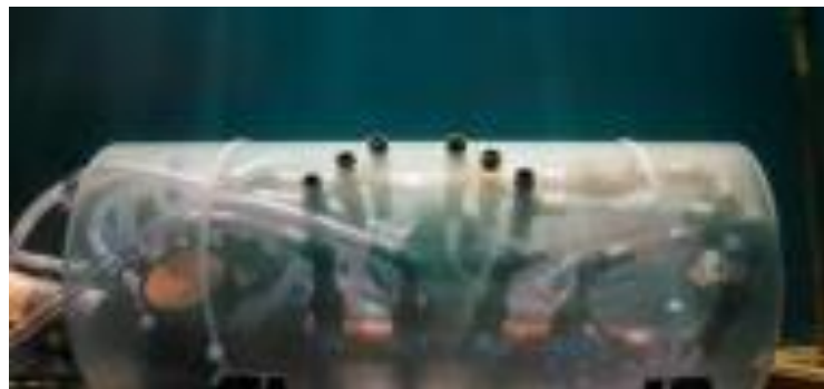
Figure 3. Hydraulophone