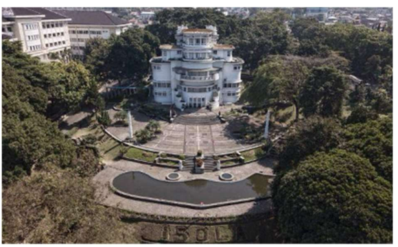
Figure 3. Villa Isola now

After Indonesian independence, the Isola villa was renovated by adding another floor above the roof, and the name changed to Bumi Siliwangi (Suprapto, 2019).