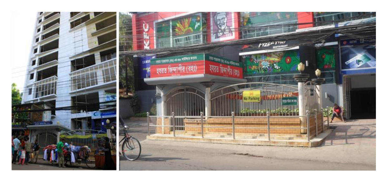
Figure 2 Tomb of Zindapir, juxtaposed between a commercial high-rise and street.

useful and in urban qualities types, making them more consentaneous with their customs of space and maintain the spirit of the historic city as a cultural manifestation.