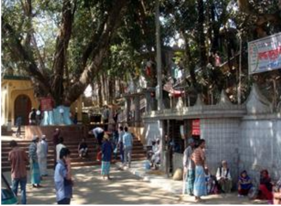
Figure 6 Upraised approaches to Hazrat Shahjalal & Hazrat Shahporan Mazar resembles the topographical context of the city.