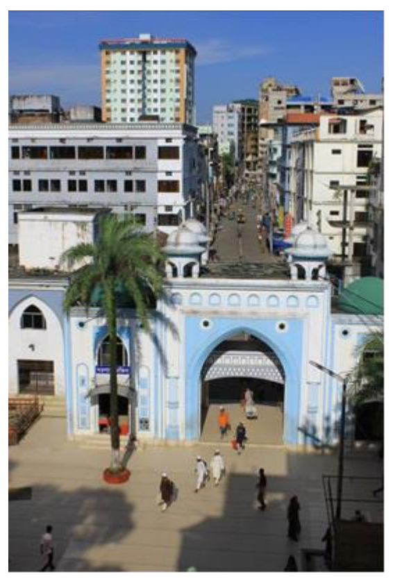
Figure 3 Rapid urban growth along the pedestrian approach road of Hazrat Shahjalal (Rh) Mazar.