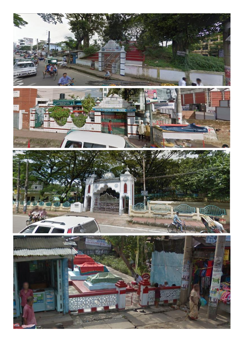
Figure 7 Roadside Mazars giving a unique in visual integrity of the city as a sacred landscape.