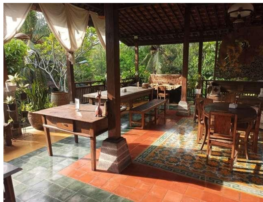
Figure 10. Cultural symbolism reflected in interior detailing

Puri Brata Gallery thoughtfully embeds local cultural identity into its architectural composition, creating a layered experience that merges environmental sustainability with traditional aesthetics. The use of regional motifs, artisanal carvings, and symbolic ornamentation throughout the resort serves not only decorative purposes but also reinforces the spiritual and historical narrative of the space.