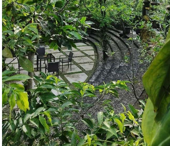
Figure 11. Plant-integrated spatial interior

authenticity. Decorative carvings and traditional patterns accentuate the space without overwhelming it, creating an environment that is culturally immersive yet visually balanced. The ambient lighting, strategic openness, and subtle fragrance of wood harmonize to deliver a sensory experience that links visitors to the cultural essence of Java. By fusing traditional architectural vocabulary with ecological design principles, Puri Brata not only preserves local heritage but also recontextualizes it within a sustainable tourism framework, offering an experience that is as respectful as it is restorative.