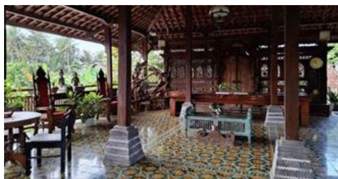
Figure 11. Interior of the Pendopo Pavilion

Traditional Javanese design elements are integrated seamlessly into both structural and interior features, most prominently within the pendopo —a central open pavilion that embodies communal life in Javanese culture. This space is not merely functional; it is ceremonial and social, providing a setting for interaction, contemplation, and connection with the natural surroundings.