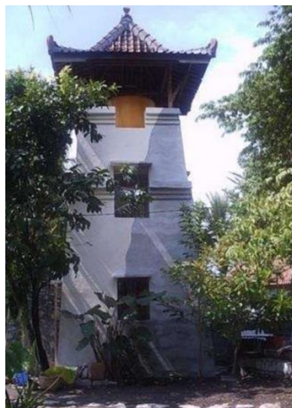
Figure 5. Kul-Kul tower serving as integrated water system

Puri Brata Gallery exemplifies an innovative approach to water sustainability by incorporating a rainwater harvesting and gravity-fed irrigation system directly into its architectural configuration. Rainwater is collected, processed, and redistributed using a multi-level spatial concept rooted in traditional forms—most notably through the vertical adaptation of the kul-kul tower.