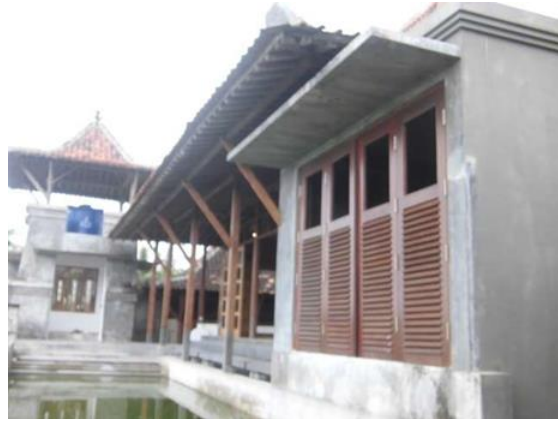
Figure 4. Wide Aperture

ecologically conscious destination. The thoughtful placement and unobtrusive design of the solar infrastructure exemplify how environmental systems can complement, rather than compromise, architectural aesthetics.