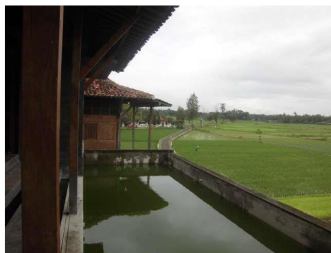
Figure 7. Landscape-framed Perspective of Puri Brata Resort

This site-specific design approach not only enhances visual harmony but also reinforces ecological performance by preserving existing vegetation, facilitating natural drainage, and maximizing views and airflow. The resort draws conceptual strength from Tri Hita Karana , a Balinese philosophical framework that advocates for balanced relationships between humans, nature, and the divine. By embodying this philosophy, the resort's design becomes a vehicle for cultural expression and environmental mindfulness—counteracting the fragmenting effects of consumerism and material excess. As such, the architecture fosters a meditative experience that aligns spiritual values with spatial order, inviting guests to engage with the environment in a meaningful and peaceful manner (Ismulyadi, 2018).