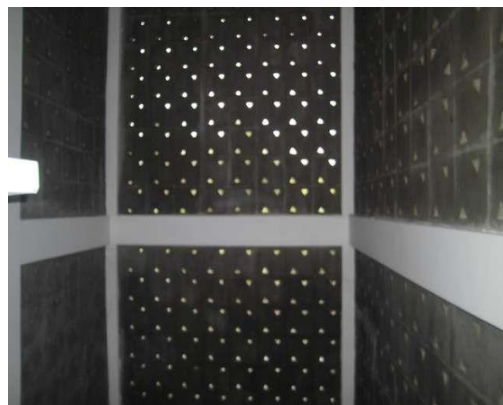
Figure 9. Perforated Wall Detailing with Roster Blocks at Puri Brata

Further enriching the spatial experience is the curated presence of artworks and sculptural elements within the gallery environment. These are not treated as decorative afterthoughts but as integral components of the spatial narrative, encouraging emotional engagement and multi-sensory interaction. Together, these design strategies cultivate an architectural setting that is immersive, context-sensitive, and evocative—offering visitors a distinct sense of place that honors both nature and culture.