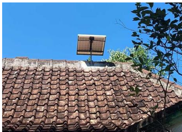
Figure 3. Rooftop solar panel array at Puri Brata

As part of its eco-aesthetic framework, Puri Brata Gallery incorporates solar energy technologies to support its environmental performance goals. The installation of rooftop solar panels provides a renewable and clean energy source that aligns with the resort's broader commitment to sustainability. These photovoltaic systems are carefully positioned to minimize visual intrusion while optimizing solar gain—demonstrating how functional green infrastructure can be seamlessly embedded within the architectural language.