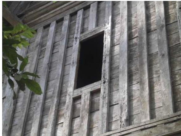
Figure 2. Reclaimed timber used in furniture and finishes

of these materials enhance the sensory experience of the built environment, illustrating how ecological choices can simultaneously elevate aesthetic outcomes.