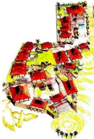
Figure 6. Site-responsive architectural layout

The architectural concept of Puri Brata Gallery demonstrates a deep sensitivity to its environmental context, with building massing and spatial orientation carefully adapted to the site's existing natural contours and scenic qualities. Rather than imposing rigid geometries onto the landscape, the resort's layout flows organically with the terrain, enabling visual and spatial continuity between built forms and the surrounding environment.