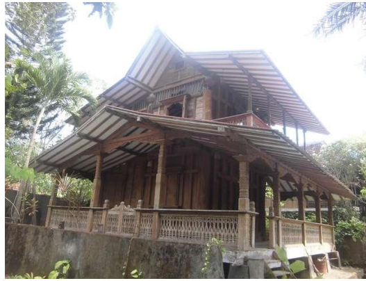
Figure 8. Exterior façade blending with natural landscape

The architectural expression of Puri Brata Gallery exemplifies a deliberate integration of natural materials and contextual aesthetics, which collectively reinforce both environmental and sensory experiences. Timber and stone—sourced locally—are extensively used throughout the exterior and interior elements of the resort, enabling a seamless visual and tactile connection between the built form and the surrounding landscape. These materials not only minimize the environmental impact of construction but also embody a cultural authenticity that reflects regional identity.