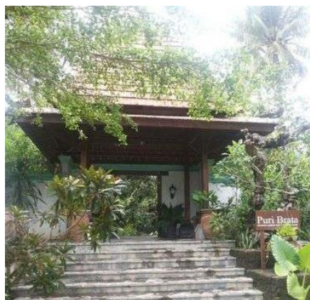
Figure 12. Cultural interpretation through gate design

In the context of resort architecture, green design is not only a functional strategy for environmental performance but also a deliberate aesthetic gesture that shapes the overall atmosphere of place. At Puri Brata Gallery, vegetation is treated as an architectural element—carefully curated and positioned to enhance spatial composition, sensory appeal, and ecological benefit. Plant selection is guided by visual parameters such as canopy form, leaf texture, color variation, and flowering cycles, contributing to an ever-evolving aesthetic landscape. This thoughtful integration of flora fosters a symbiotic relationship between built structure and living systems, allowing the resort to embody principles of biophilic design. Green spaces are woven into courtyards, perimeters, and circulation paths—not only to frame views and soften transitions, but also to support psychological comfort and well-being among guests. Visual plant characteristics significantly influence perceived beauty and spatial harmony, a notion clearly reflected in the spatial choreography of the resort (Lestari & Gunawan, 2010).