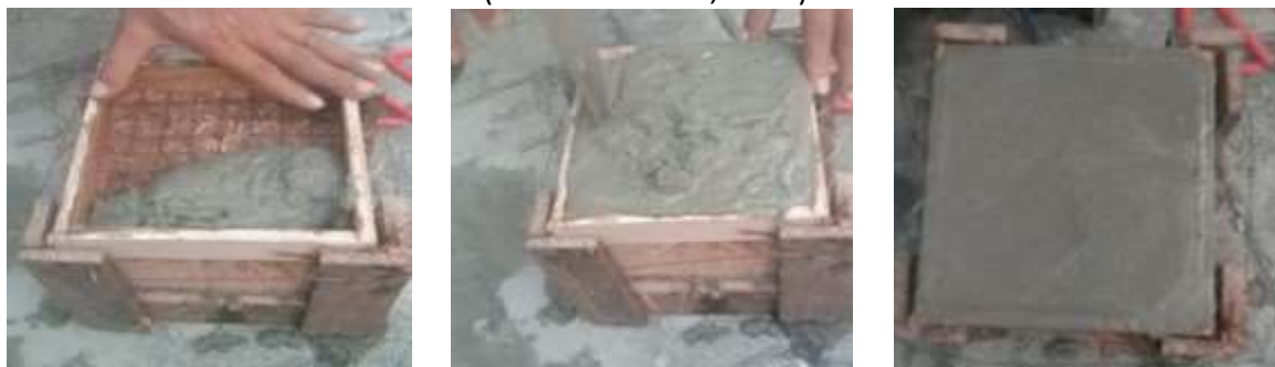
Figure 2 Concrete-Making Process and Testing with Composite Concrete Cubes