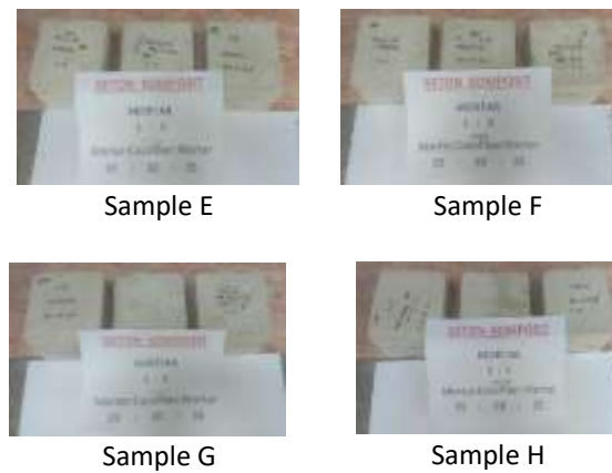
Figure 4 Photo of Composite Concrete Cube Specimen with Coconut Fiber