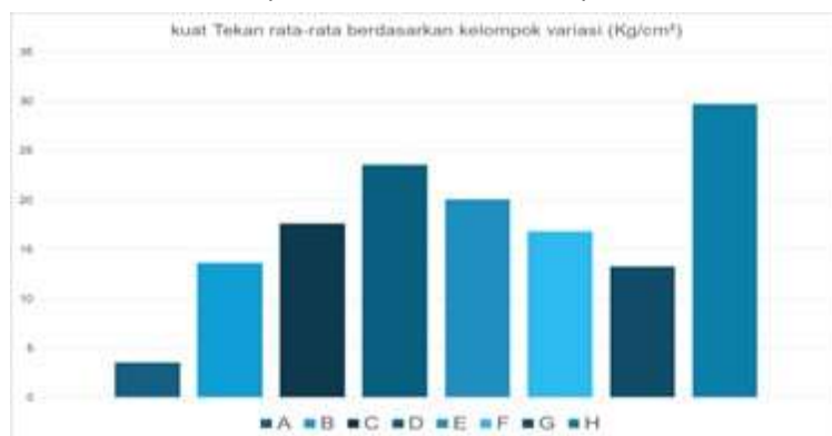
Figure 6 Average Compressive Strength Graph by Test Concrete Variation Group