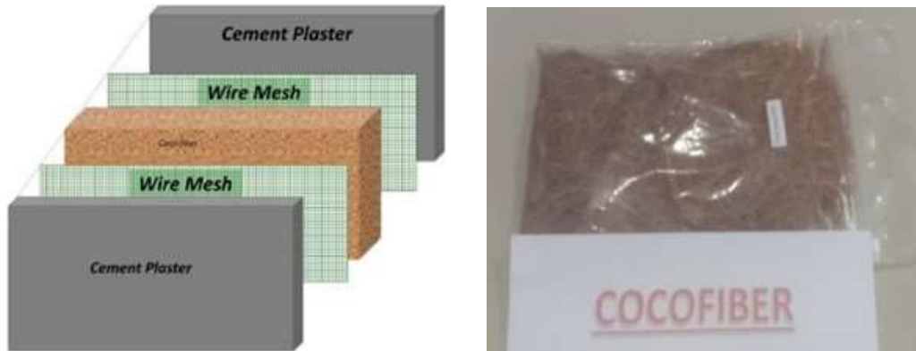
Figure 1 Configuration layout of the composite wall with layer system

Furthermore, wire was used to clamp and compact the fibers. The mortar was mixed until homogeneous, according to the specified ratio. After that, the mortar and fiber were molded using the provided mold in a sandwich arrangement, where the fibers were placed in the core of the wall and sandwiched with wire and mortar on both sides of the coconut fiber, forming five layers (Figures 1 and 2). The specimens were cured using the wet curing method for 7, 14, and 28 days to ensure maximum strength. Before testing, all specimens were grouped based on their sample types, and images were recorded along with the sample variation settings (Figure 3).