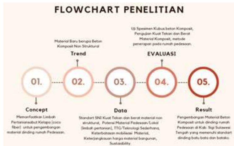
Figure 3. Flowchart Study