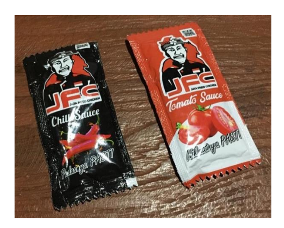
Picture 4 JFC chili sauce (left) and tomato sauce (right) packaging.

The JFC chili sauce packaging is dominated with black color as the background of the packaging. Black is a neutral color that can be combined with contrast color to create variation and accentuation of the design. Red color is design variation that applied almost 50% on the packaging area. Black and red have medium contrast level, so red color role as sub-ordinate color portion. White color in this packaging role as the accent color portion because it applied less than the black color. Moreover, the white color has a strong contrast level toward black color and medium contrast level toward red color. Gray and green color is applied least at this packaging and role only as decorative.