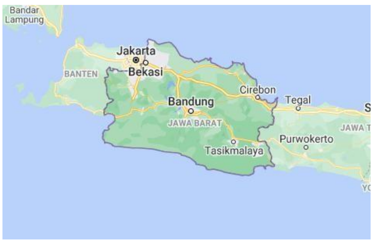
Figure 1. Map of West Java Province

This research uses descriptive quantitative research methods with secondary data analysis approach. Secondary data analysis is a method that utilizes secondary data as the main data source or from data that is clearly valid, obtained from certain agencies or institutions and then processed systematically and objectively. The location of the research was carried out in several districts/cities in West Java Province, including: Bandung City, Bogor City, Sukabumi City, Cirebon City, Bekasi City, Depok City, Cimahi City, Tasikmalaya City, Banjar City, Bandung Districts and West Bandung Districts. The location of the province of West Java is shown in Figure 1.