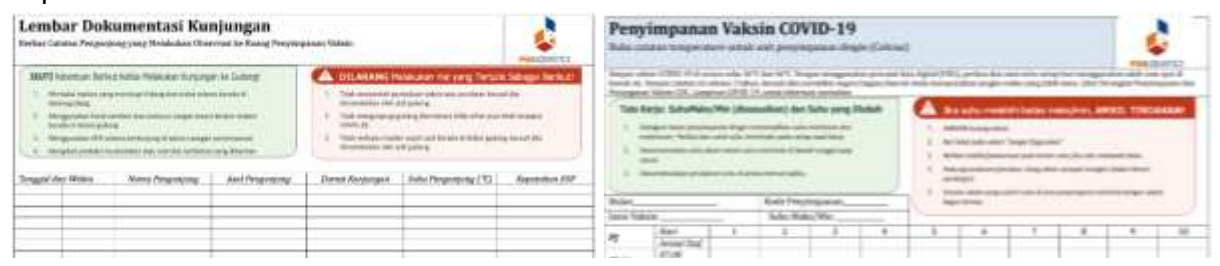
Figure 4. Correspondent Monitoring Document Attached in the SOPs

The "Handling of External Visits" Standard Operating Procedure (SOP) has two important main objectives. First, this SOP aims to ensure the safety and security of company facilities by organizing external visits. It helps reduce security risks by identifying parties who are allowed to access certain areas and protecting confidential company information. Second, this SOP serves as a clear guide in organizing and supervising external visit activities, including determining the purpose of the visit and scheduling it in a structured manner. As such, the "External Visit Handling" SOP is critical in maintaining the integrity of the company's operations and protecting valuable information. On the other hand, the SOP "Vaccine Storage Control" was created in response to findings related to vaccine storage. This document will describe the steps to be taken to closely monitor storage temperatures, manage vaccines approaching their expiration date, and identify actions to be taken in the event of spoiled or expired vaccines