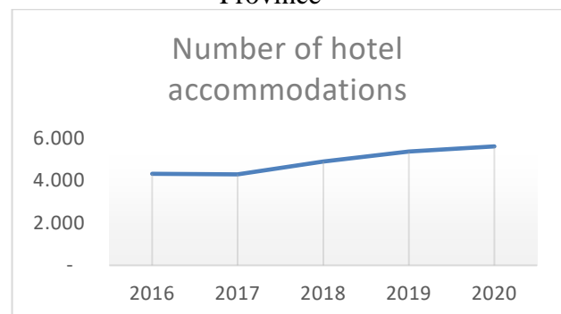
Figure 2. Number of Hospitality Accommodations in 2016-2020 Bali Province

Based on the graph above, it can be seen that the number of tourist visits has fluctuated significantly. This can be seen in 2016, the contribution of the Number of Tourist Visits amounted to 14,5 million people, this increased in 2017 by 17,8 million people and again experienced an increase in 2018 of 20,3 million people and in 2019 it decreased by 20,2 million. Until 2020, the contribution of the number of tourist visits decreased by 3,9 million people due to the COVID-19 pandemic.