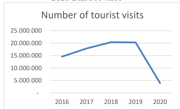
Figure 1. Number of tourist visits in 2016-2020 Bali Province