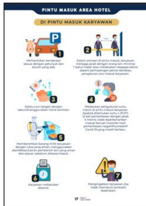
Figure 1. CHSE Guidance for Lodging – Area of Coverage

employees, temperature checking, washing hands, sanitising system, and controlling distance between individuals. The protocol starts from the entry point of the hotel, followed by the lobby area (front desk and concierge), and the guest room. Furthermore, the guidance also covers other area inside the hotel including the restaurant or coffee shop, banquet, housekeeping area, office, employee area (locker and dining room), kitchen, and any public area.