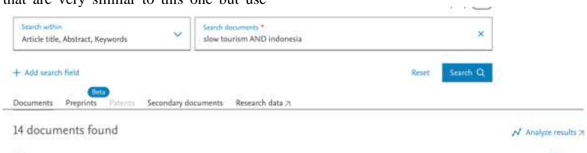
Figure 4. Slow Tourism Indonesia Search Result on Scopus.com

Now, specifically the trend of slow tourism study in Indonesia. Not to mention the network visualization and density visualization. Based on scopus documents search the result is as below figure