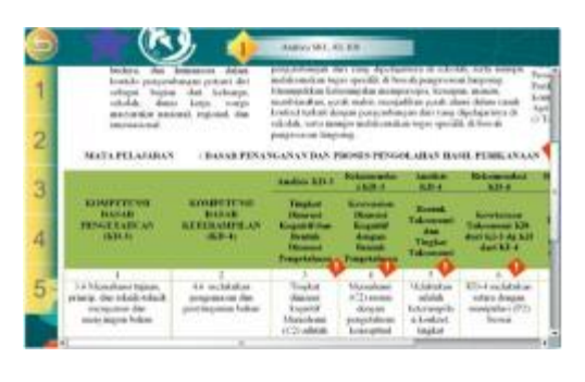
[Analytic Material Display]