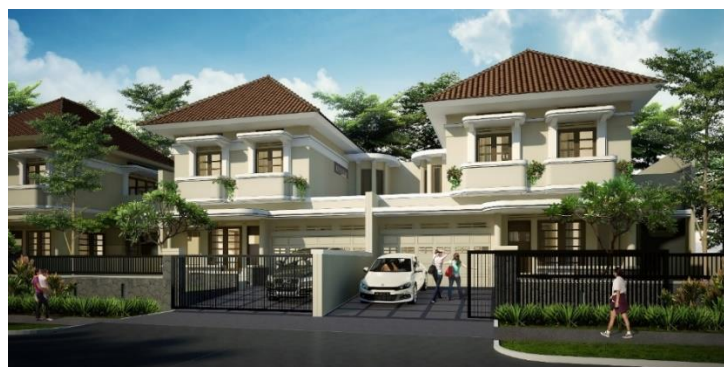
Figure 9. Front view of BTD house

Next, at this point, we will discuss the appearance of the building, and also the elements in the building. In the picture below you can see that the design of this house uses an art deco form which refers to buildings in the Braga area. One of the characteristics of the Art Deco style is that it has arches on the side of the building which can be seen from the balcony, canopy, and also the side of the building. It has openings such as windows and doors that are large enough to add a colonial impression with glass material wrapped in aluminum frames or frames instead of wood. The face of the building uses a clean design, there are no carvings or motifs like the Greek style, and is more representative of Modern Colonial Architecture.