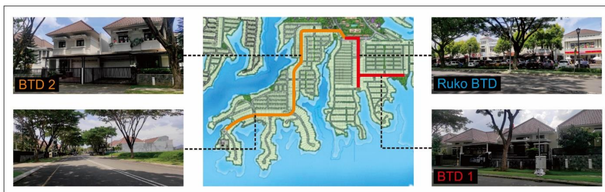
Figure 6. BTD location