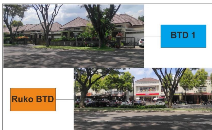
Figure 7. BTD 1 & BTD Ruko

BTD 1 is located along the cluster corridors R5-6, R8-9, R11, R12. In this area, there are houses as residences and shophouses as commercial areas or supporting facilities for the surrounding community which have a Colonial architectural design.