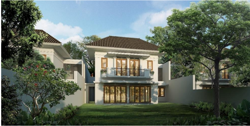
Figure 10. Back view of the BTD house

Then, at this point, we will discuss the top of the building or roof. From the picture below you can see that this house has 2 separate buildings. The roof used is a tile roof with a gable roof shape and several buildings use shield roofs. Roofs like this are always used by buildings in tropical areas. Just like the colonial design that entered Indonesia, it uses a sloping roof. However, some parts of this house use a flat roof like the Modern Colonial Architecture style.