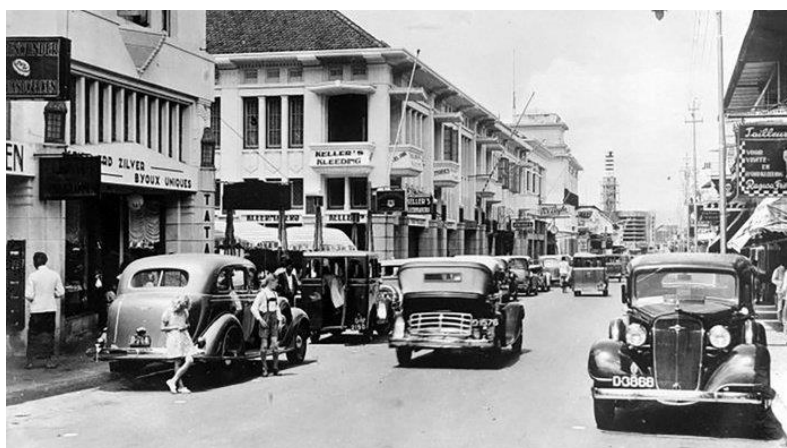
Figure 2. Braga Street in the Past

Colonial architecture is an architectural style left over from the Dutch rule when they colonized Indonesia and is also a great asset and cultural heritage in the history and life of the founding of the Indonesian state. (Nurhasanah et al. 2016). According to (Handinoto 2012), colonial architectural styles in Indonesia are divided into 3 parts according to the time they were implemented, including the Indische Empire (18-19 Century), Transitional Architecture (1890-1915), and Modern Colonial Architecture (1915-1940). All of these architectural styles have their differences and characteristics because they follow architectural developments in Europe over time.