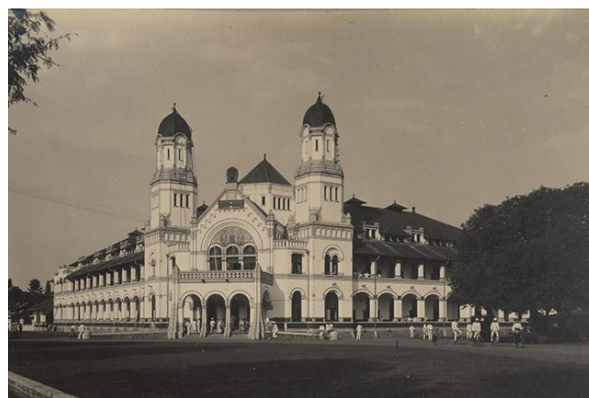
Figure 4. Lawang Sewu