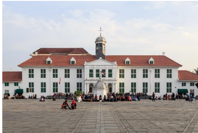
Figure 3. Fatahillah Museum

The Fatahillah Museum is an example of an imperial-style building. Initially, this building was the administrative office of Batavia or Jakarta during the reign of Governor-General Joan van Hoorn. Later, this style was developed by Governor Herman Willem Daendels in complexes or residential areas for Dutch people in Jakarta.