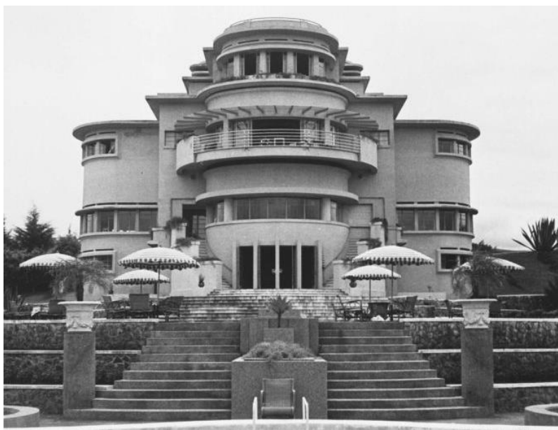
Figure 5. Villa Isola (Source:(Wikipedia 2022c))

Villa Isola is an example of a building with a Modern Colonial Architecture design in the art-deco style. This building was designed by Dutch architect CP Wolf Schoemaker and was completed in 1933.