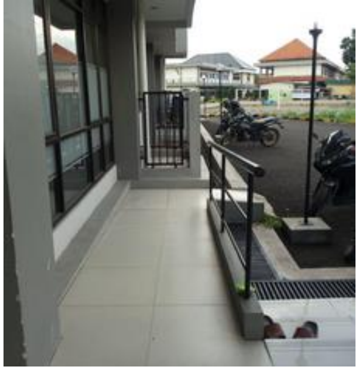
Figure 3. Ramp Entrance

According to Permen PU No. 30/PRT/M/2006, the requirements for the ramp are textured and nonslip, with a maximum interior gradient of 2° and a maximum exterior length of 6°, and a maximum track length of 900 cm (7°). Here is a picture of the entrance ramp area in the student flat that connects the entrance terrace and the parking lot.