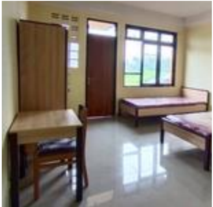
Figure 4. Residential unit furniture

This disabled housing unit is facilitated with furniture, namely 2-bed units. 2 units of a study desk, and 2 units of wardrobe. This furniture facility is the same as the usual residential unit facilities, nothing is different.