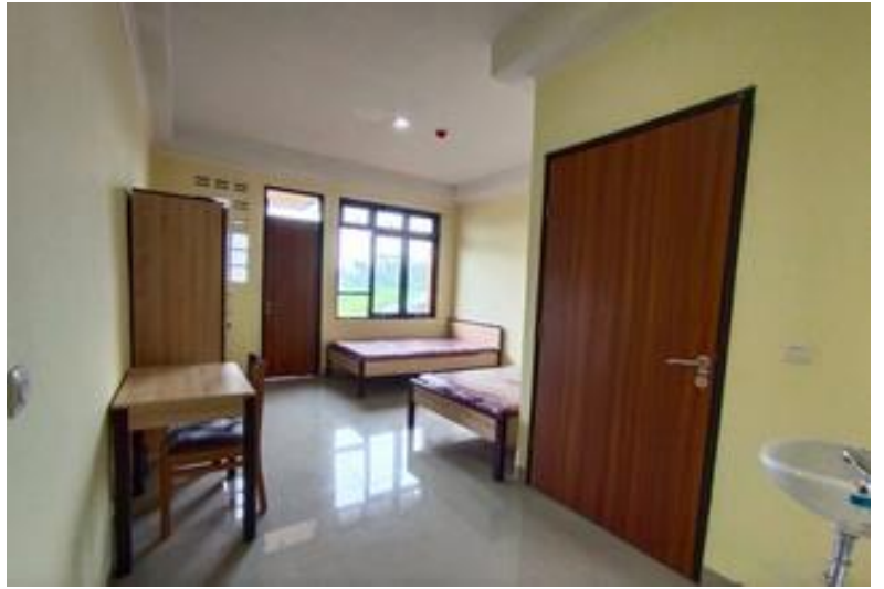
Figure 1. STAIPI Student Flats for Difable Residential Units

their convenience (Wicaksono 2020). There are 2 residential units for the disabled in this student flat with an area of 28.9 m2 each. Inside there is 1 bathroom unit measuring 3.51 m2 and a balcony drying area with an area of 2.5 m2. In the area of this disabled dwelling unit, the Public Housing Government Regulation Number 14/PRT/M/2017 concerning the convenience of building buildings such as a wider bathroom area and in the closet area there is a toilet grab bar to make it easier for residents to stand up after using the closet by holding hands. grab bar toilet. This grab bar has a position and height adapted to wheelchair users and other disabled people, this grip makes it easier for wheelchair users to move(Lustiyati 2019). This bathroom includes a bathroom door with a width of 1 m, as well as other door openings such as the main door and a door leading to the drying area. The following is the appearance of the disability-inclusive implementation facility in STAIPI and UNSIL student flats.