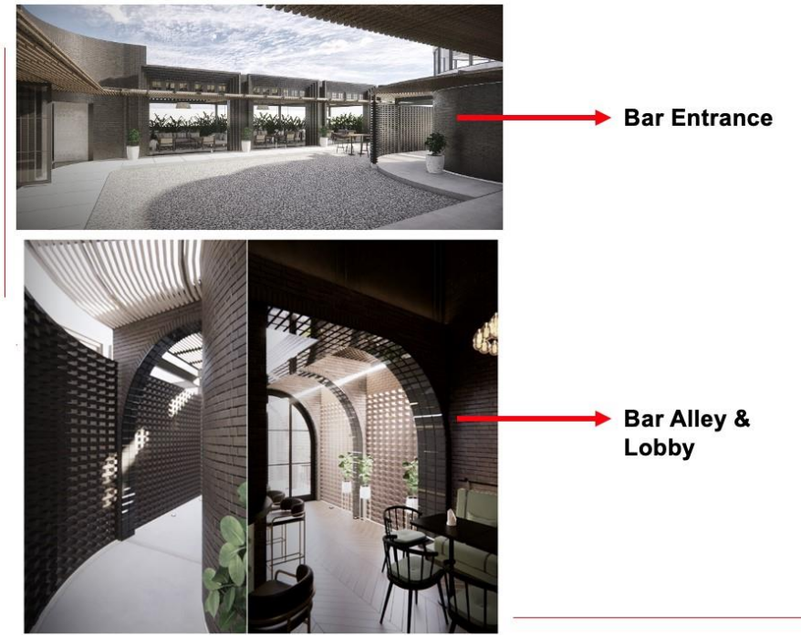
Figure 2. Hidden Bar Entrance of Tamblong Restaurant

In Figure 1. You can see the bar area is separated from the restaurant area and has access from the outdoor terrace area in the middle of the restaurant. A bar that is designed to be elongated with an area of 118 m2 has a capacity of 46 to 50 visitors.