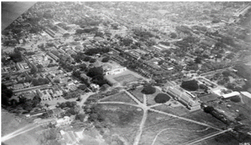
Figure 3. Medan Merdeka Garden Earlier

Medan Merdeka Garden has served as Jakarta's development hub ever since the colonial era. This occurred when the Koningsplein Square (Taman Medan Merdeka), the hub of Batavia, was approved by the colonial government's master plan in 1937. The Taman Medan Merdeka neighborhood in Central Jakarta is home to the majority of significant government structures. The office sector occupies about 75% of the space in Central Jakarta, with the remaining 25% being made up of highways and housing.