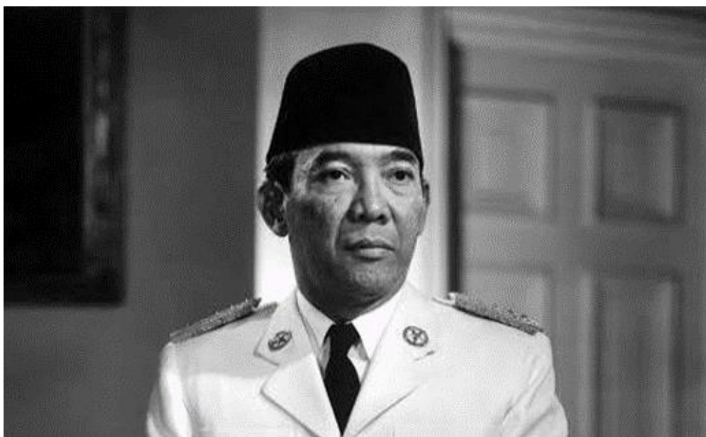
Figure 2. President Soekarno

President Sukarno was the main supporter of the construction of the National Monument. This figure also initiated the construction of a history museum in the form of a diorama placed inside the National Monument. Sukarno wanted the history museum to be built inside the National Monument with the aim that the public could understand the journey of their nation's history well. The journey of the nation's history can be understood much more deeply when presented together with other national symbols of Indonesia found in the National Monument (Kanumoyoso 2020).