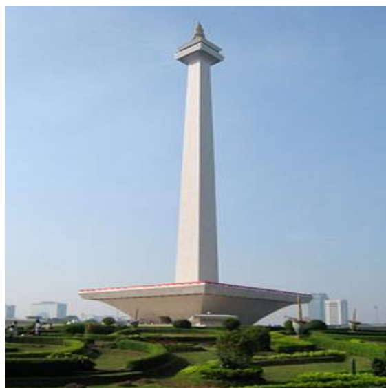
Figure 6. National Monument (Monas)

In addition, this concept features the traditional rice-pounding tools of a pestle and mortar, which symbolize President Soekarno himself. The year, month, and date of Indonesia's independence are likewise reflected in Monas's dimensions. Overall, the Monas monument's overall shape resembles a pestle and mortar, namely equipment for pounding rice, a design idea that was directly put forward by Ir. Soekarno, the first president of the Republic of Indonesia. The principles of the Indonesian people, who always seek prosperity and a high level of living for the community through cooperation, are thus symbolized by the Monas design.