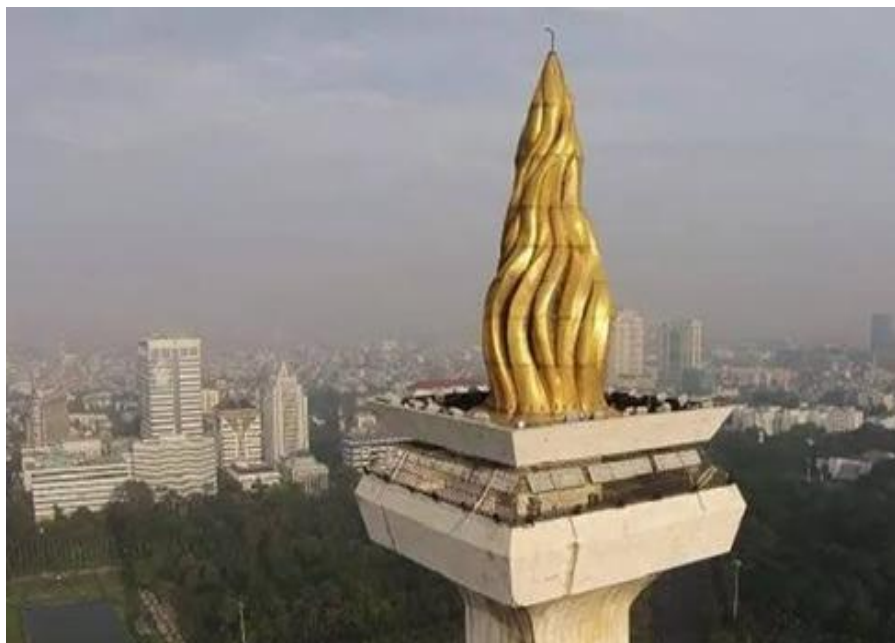
Figure 5. Golden Flaming Tongue

A flaming tongue of fire made of pure gold adorns the peak. This refers to the enthusiastic struggle of the Indonesian people against colonialism. This golden tongue of fire is situated within what is known as a cup.