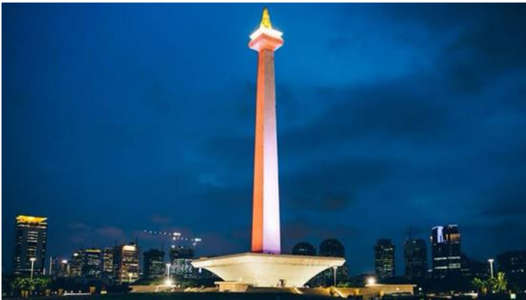
Figure 1. National Monument (Monas)

The National Monument serves as the author's source of inspiration for the building's aesthetics, enabling him to create a new piece of art by Sanaji that takes the shape of a spear. The new spear project aims to preserve historical values and honor the Indonesian people's long-standing fight by providing a spear crafted by the author.