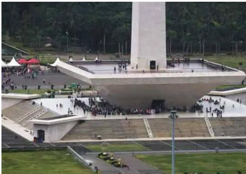
Figure 8. The Courtyard of National Monument (Monas)

The lower courtyard of the National Monument (Monas), also known as the cup courtyard, has philosophical significance as a symbol of fertility and vigor that supports the Indonesian nation. The cup courtyard also has other measurements, such as its height of 17 meters, which represents the date 17. The plaza is 45 by 45 meters and commemorates Indonesia's independence in 1945. The distance between the museum area at the bottom and the base of the cup is 8 meters, representing the month of August. The National History Museum is also located beneath the cup courtyard.