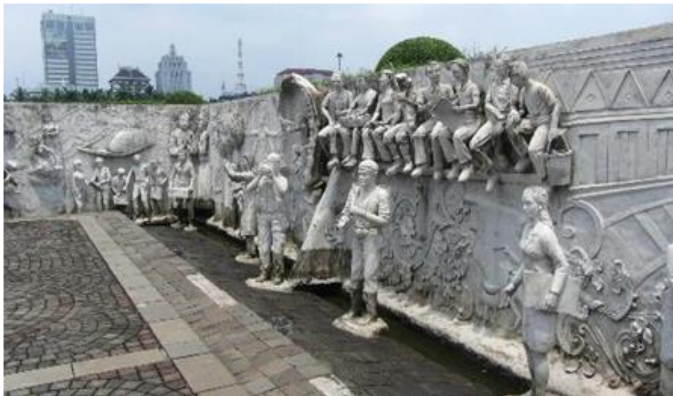
Figure 9. The Indonesian History Relief

Reliefs portraying Indonesian history may be seen in each corner of the enormous courtyard that surrounds the monument. These reliefs begin in the northeast corner and depict the archipelago's historical magnificence, as well as the history of Singasari and Majapahit.