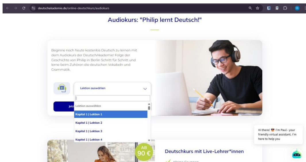
Figure 3. Display of the Interactive Practice Feature in DeutschAkademie

Full details of the Oberfläche und Navigation evaluation results based on Rösler's (2002) Criteria can be found in Appendix 2, pages 60-61.