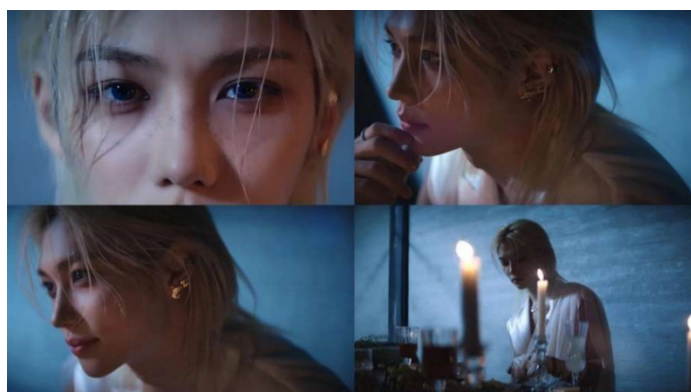
Figure 3. Beast's appearance in his symbolic stage (after he meets Belle).