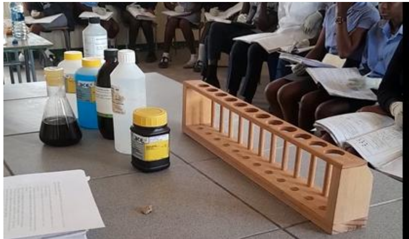
Figure 2. Learners' sitting arrangement during a practical demonstration lesson observing a practical on food tests at a poorly resource lab, without proper benches, illustrating restricted access to laboratory apparatus and reduced experiential learning opportunities.