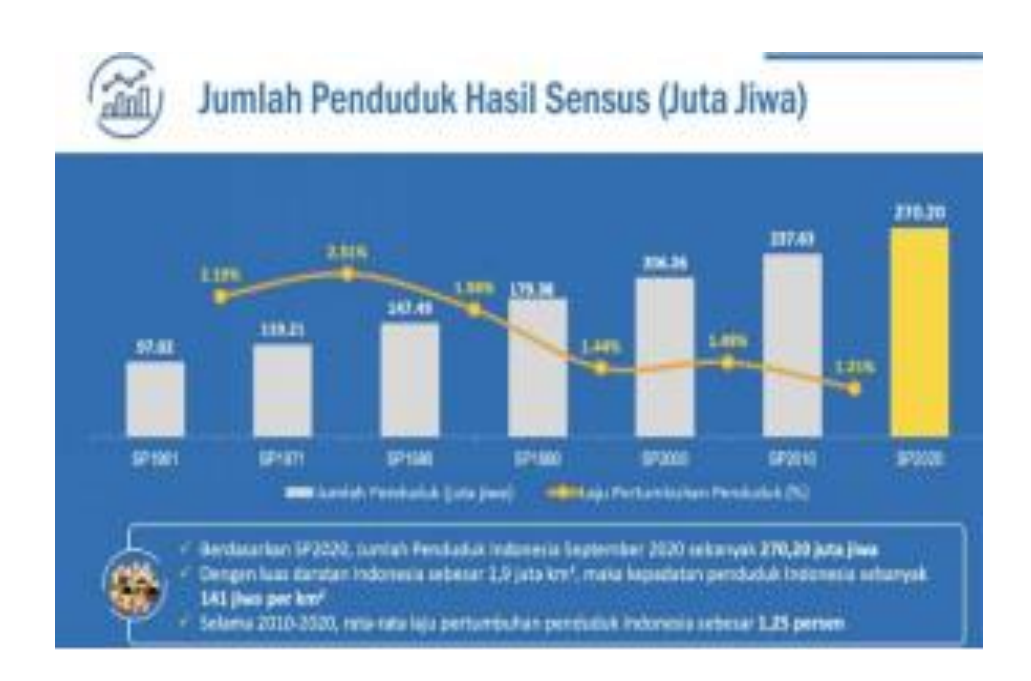
Figure 1. Number and Growth Rate of Indonesian Population

explains that a large population with high population growth is a basic capital of development, but on the other hand a large population with high population growth will also be a burden for a country to meet the basic needs of its population such as clothing, food. and boards and other necessities. See figure 1 .