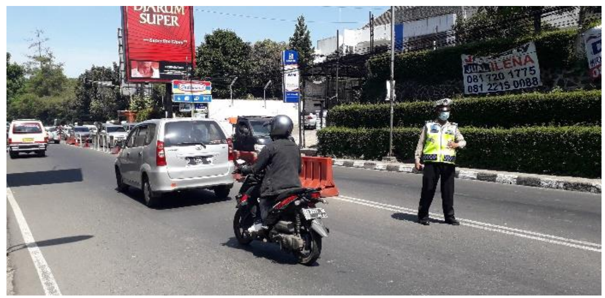
Figure 1. Police Regulate Traffic

At this stage the interview was carried out in two places, namely at the post and the environment around the plumbing terminal. Conducting an interview at the Gatur post then with the Head of the Cidadap Police Traffic Unit, while for around the plumbing are citizens who are on the move and are users of motorized vehicles moving in Bandung city traffic. An interview is a conversation with a specific intention. The conversation is carried out by two parties, namely the interviewer who asks the question and the interviewer who provides the answer to the question. Includes constructing through people, events, organizations, feelings, motivations, demands, care, and others. Reconstruct such sphericities as experienced in the past. Among the interviewees are: