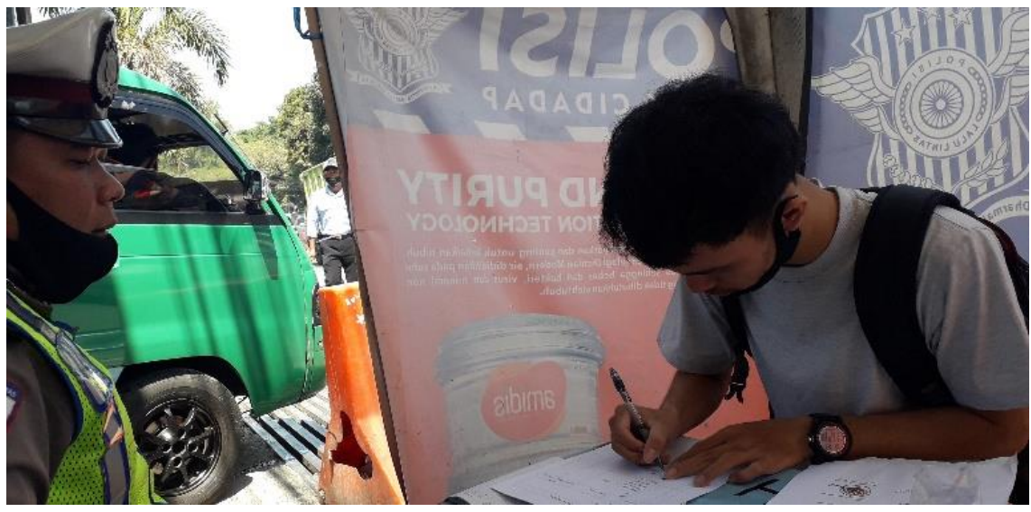
Figure 2. Interview with Police

The recorded resource persons are resource persons whom researchers meet and carry out interviews in the field where the research is located. After the interview is complete and the data you want to look for has been deemed sufficient to be collected, then the researcher compiles the data received based on the formulation of the problem contained in this study. Figure 2 , the process of interviewing researchers with the police post gatur cidadap.