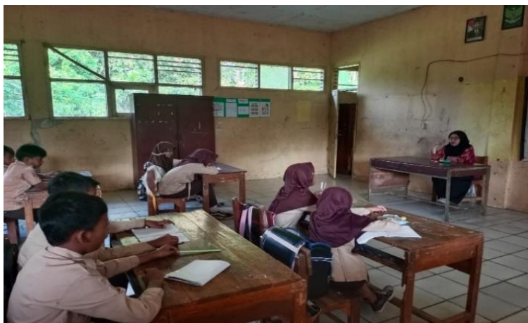
Figure 1. Asking Triggering Questions to Students