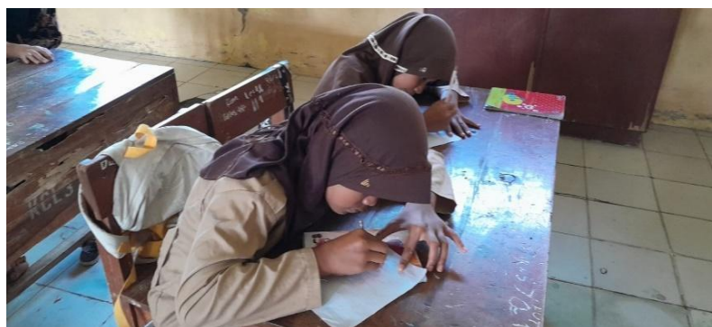
Figure 2. Writing Activity Journaling