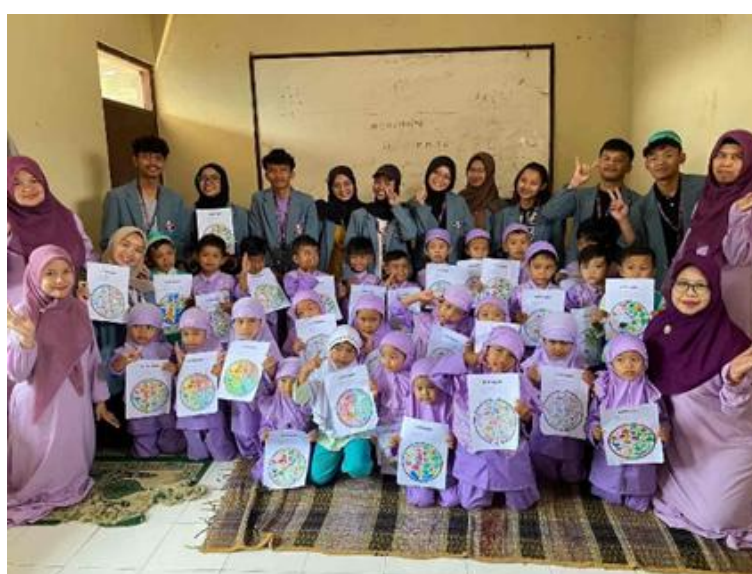
Figure 2. Group photo at Al-Hidayah Kindergarten

The socialization was conducted in two kindergartens, one early childhood education center, and one elementary school in Margaasih Village, focusing on providing materials to students. Before conducting the socialization with the students, orientation methods were carried out, including introductions, jokes, and singing. Such ice-breaking activities were necessary to ensure that the students' attention was entirely focused on the community service team. Once the students were settled, the community service team provided education on the importance of a balanced diet, using the theme "Isi Piringku" (My Plate). The theme was presented using paper materials featuring an image of a plate containing various nutritious foods such as staple foods (rice, corn, bread, noodles, and others), vegetables (broccoli, bok choy, cabbage, eggplant, and others), fruits (grapes, bananas, mangoes, and others), and side dishes (fish, tofu, tempeh, meat, and others). Then, the students were given 30 minutes to color any foods they liked and enjoyed.