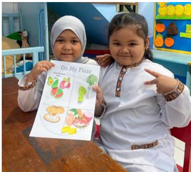
Figure 3. The results of the children's coloring

Their preference can be demonstrated through various types of nutritional intake, including staple foods, vegetables, fruits, and side dishes. However, it is also known that, on average, students who are also children in Margaasih Village do not like green vegetables such as bok choy, mustard greens, long beans, cabbage, and eggplant. They prefer fruits such as bananas, mangoes, avocados, watermelons, and others. They also often mention that their parents at home frequently provide delicious, nutritious foods, such as corn, noodles, tofu, tempeh, fish, and meat. The educational activities conducted by the community service team using the "Color My Plate" method should be supplemented with real vegetables or fruits to help children better understand the illustrations provided.