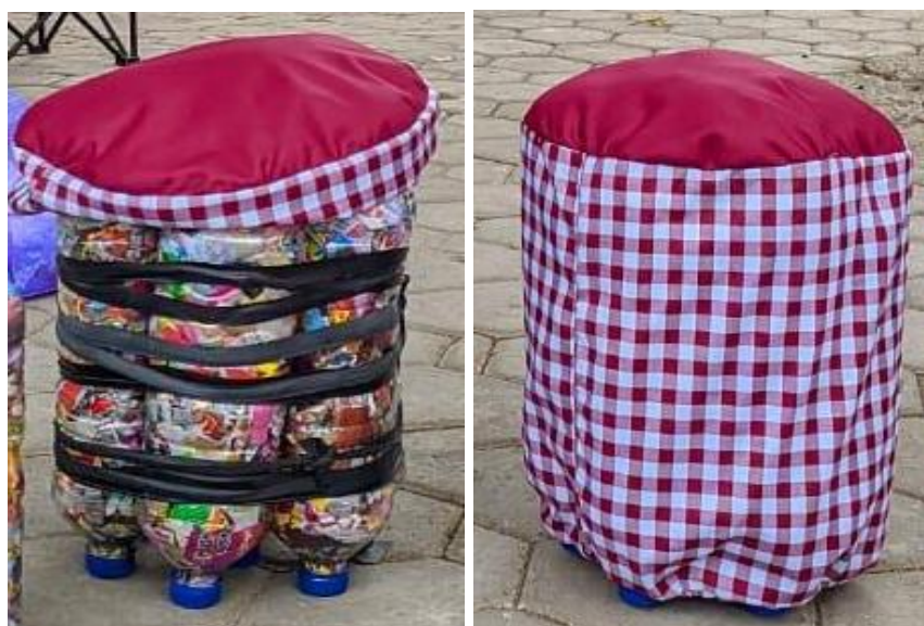
Figure 3. Ecobrick Products