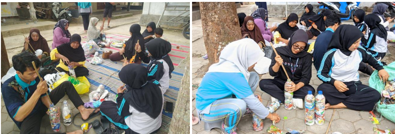
Figure 2. Ecobrick Making Activity

Community empowerment began with socialization sessions with PKK mothers on making ecobricks and utilizing waste as valuable resources. The next activity was collecting plastic waste by PKK mothers, which KKN students then collected as material for making ecobricks. The activity continued with preparing tools and materials for training in making ecobricks. The tools and materials used in making ecobricks include scissors, a cutter, a bamboo compactor, 1500ml plastic bottles, plastic packaging, plastic bags, and chair covers. The next activity is the practical demonstration of ecobrick making, followed by the PKK women trying out the stands made during the training. This activity is shown in Figure 2 . The results of the ecobricks are shown in Figure 3 .