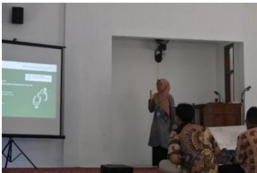
Figure 2. Session on delivering material on the procedures and methods of teaching the Qur'an by students of UIN Sunan Gunung Djati Bandung

The first material on Tahsin Al-Qur'an includes Tafhim , Qalqalah , Alif Lam , Ghunnah , Hukum Nun , and Mim Mati , and Mad Ashli delivered by students of the Department of Religious Studies from UIN Sunan Kalijaga Yogyakarta. The second material displayed in Figure 2 , "Procedures and Methods of Teaching the Qur'an," was presented by students from the Department of Islamic Religious Education at UIN Sunan Gunung Djati Bandung.