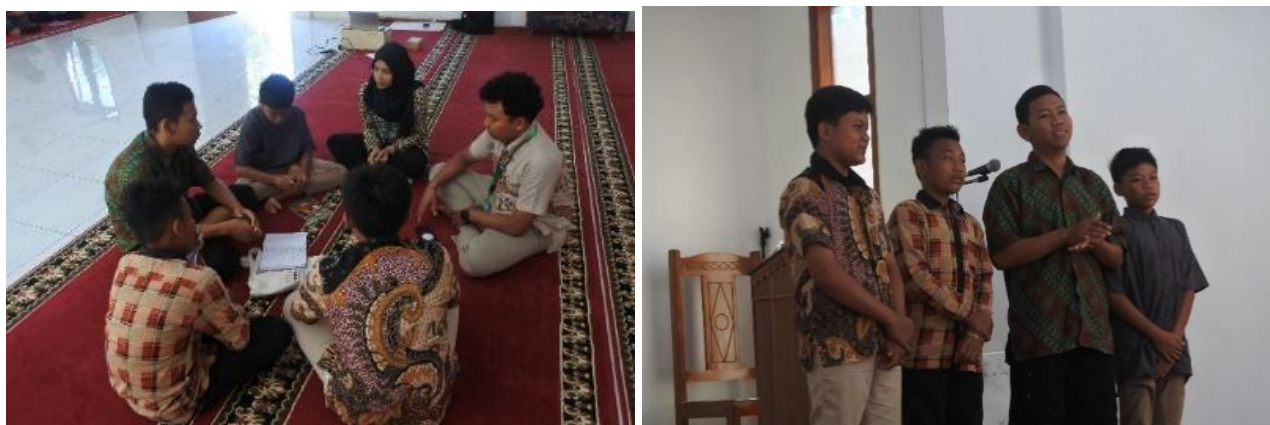
Figure 3. ToT participants discuss with mentors to design learning strategies and implement microteaching

To hone and evaluate the skills of the participants, microteaching sessions were conducted in group settings. Participants are given the opportunity to act as teachers, while presenters serve as assessment teams observing the learning activities (see Figures 3 and 4 ). Participants, consisting of seven individuals, were divided into two teaching groups: the male group (AN, EG, AM, VE) and the female group (AL, DT, PT). They practice teaching according to the material obtained and receive feedback from the assessment team.