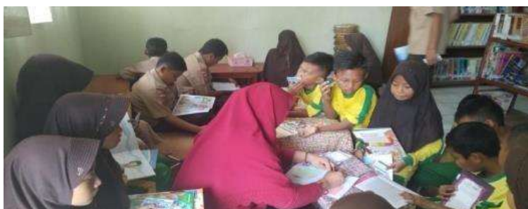
Figure 3. Increased enthusiasm for reading in the Al Ulum library.

The resulting gains include; (i) Increasing human resources with competitions and collecting the work that has been made. Each class teacher requires this activity as project-based learning as an extracurricular value in literacy activities. The collected works are added to the library collection. The procedures taken include active members, mentoring while working, checking the work between books read and works, assessment by class teachers,