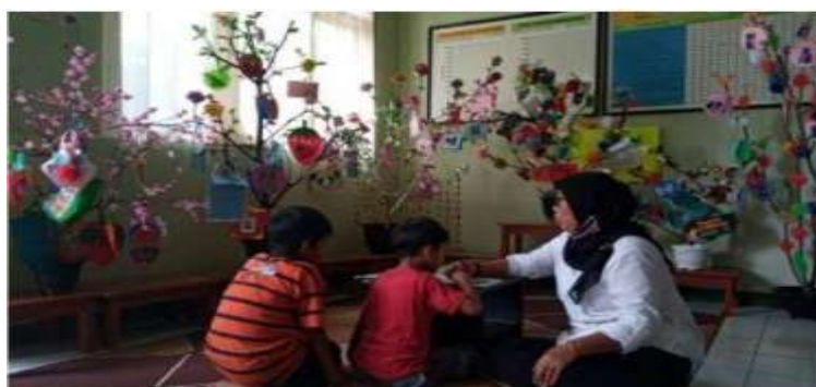
Figure 2. Students are actively working in the library.

In addition, success can also be seen in the innovations that members do, such as drawing competitions based on the books they read. And the results of writing resumes for all the classes they presented into the literacy tree were getting more and more literate leaves they made. This literacy tree is stored in the library based on grade level for workshop activities to display their work publicly.