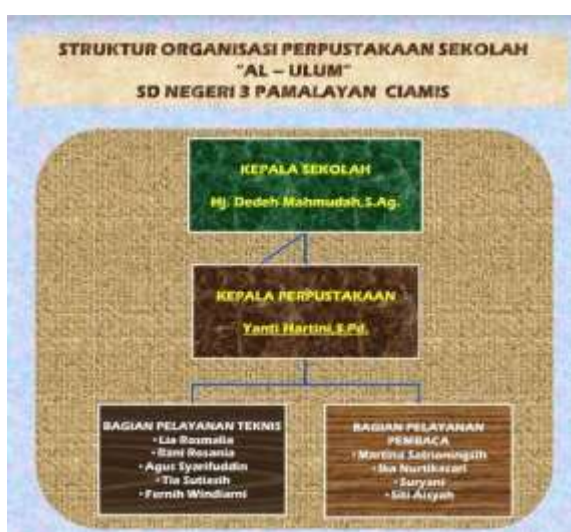
Figure 1. Al Ulum Library Organization Structure of State Elementary School 3 Pamalayan.

Schools make changes to the principal's policy. The principal assigns the task of one of the teachers to be a librarian as well as the head of the library, whose job is to guide and direct students in library activities. In addition to allocating funds for main books, schools also allocate budgets for improving the quality of teachers in the library sector, namely librarian technical guidance, training, seminars, or webinars. The other thing the school does is collaborate with the regional library of Ciamis Regency. After the librarian is given the task through the Principal's Decree, other organizational structures are arranged, including the technical and reader service sections.