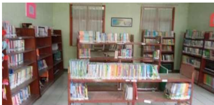
Figure 2. The position of the bookshelf in the Al Ulum library at State Elementary School of 3 Pamalayan.

The funding to plan this library activity comes from the School Operational Assistance (BOS) fund for the 2019 budget year in preparing equipment and starting materials. Parents, in this case, contribute energy to designing and planning Al Ulum library activities. Financing planning is formulated in the form of library plans and budgets so that they can use them to activate library activities. The management plan that has been prepared becomes a reference in implementing the program and measuring success based on the schedule.