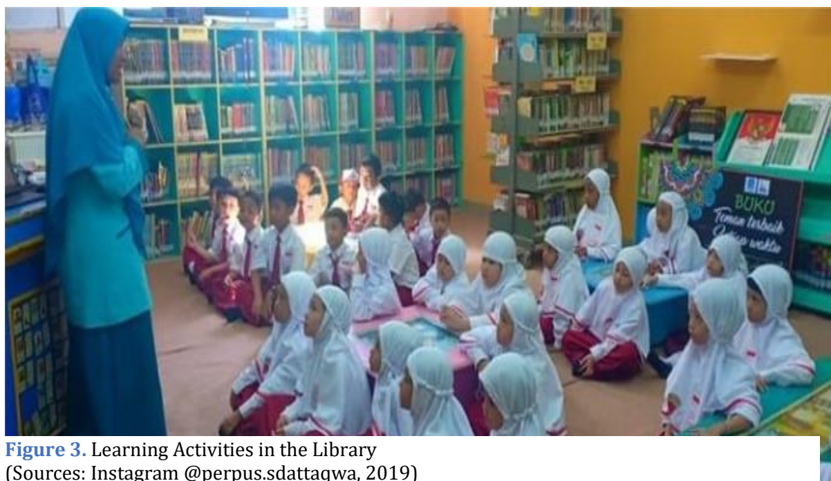
Figure 3. Learning Activities in the Library

The existence of the library as an alternative place for teaching and learning activities was greeted with high enthusiasm by the school's students. Learning activities in the library accompanied by librarians and teachers are arranged based on a particular schedule that the librarian has set. Scheduling is done so that visits are more systematic and less noisy, considering that from grades 1 to 6, there are 29 classes. The stop-and-study movement in the library is deemed adequate for optimizing services in the library (Suharyadi & Saputra, 2020), and is considered a recreational event for students due to the change in the learning atmosphere from the classroom. One of the learnings in the library is education about the types of library collections the librarian, which is depicted in Figure 3.