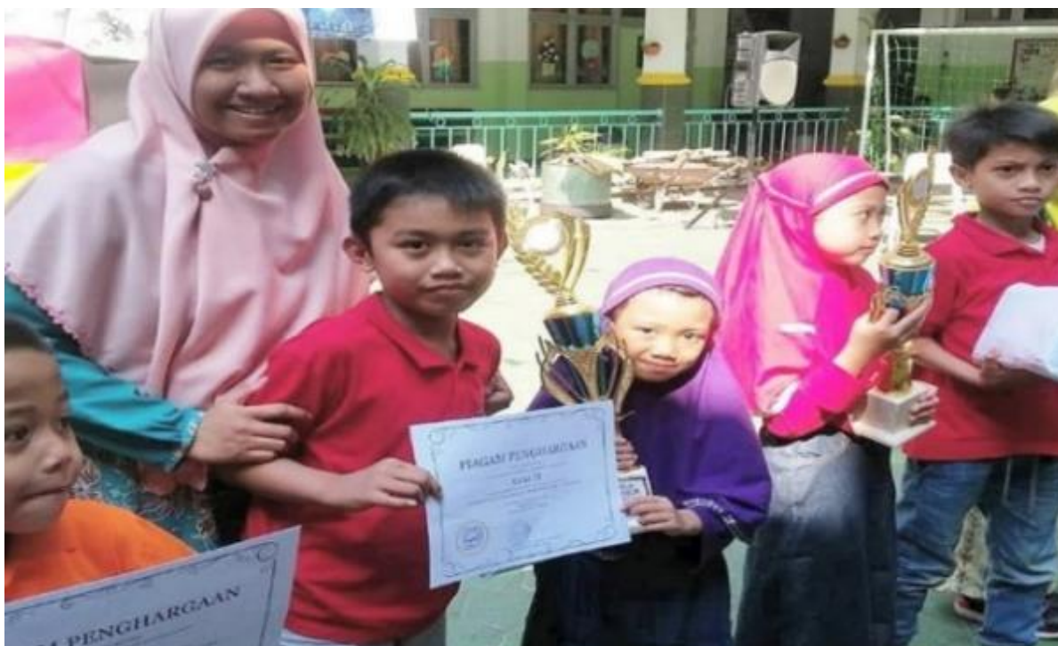
Figure 1. Giving awards to students

Monitoring activities are carried out through the provision of monitoring cards by the library, which students must fill out about the collections that have been read later at the end of each theme, the card is reported to the librarian as evaluation material. Evaluation is an important stage because it is used to assess the suitability of reading books with themes and reading charts and as an instrument to monitor students' seriousness or to fill in.