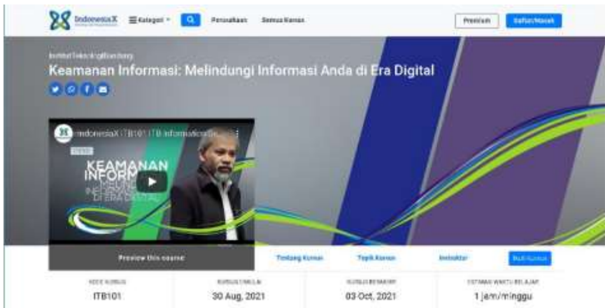
Figure 2. Display of IndonesiaX course platforms

In addition to the sites above, there are also local sites such as: (i) SkillsAcademy by Ruangguru ( skillacademy.com ); (ii) Maubelajarapa ( maubelajarapa.com ); (iii) Hacktiv8 ( hacktiv8.com ); (iv) Pintaria ( pintaria.com ); (v) Pijarmahir ( pijarmahir.id ); (vi) IndonesiaX ( indonesiavax.co.id )