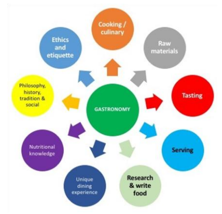
Figure 1. Component of Gastronomy

Turgarini 2018 stated that gastronomy is not merely culinary in the kitchen but also relates to the ins and outs of cultures, especially human behaviour in selecting raw material, and then in tasting, feeling, serving the food and having consuming experience, as well as in seeking, learning, researching and writing about food and everything relates to ethics, etiquette and nutrition for people in different countries (Figure 2).