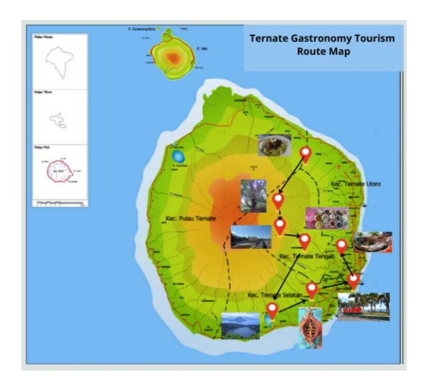
Figure 4. Gastronomic Tourism Route in Gastronomy City