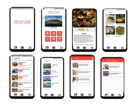
Figure 3. Ternate City Gastronomic Tourism Android Application Display Menu

to the home menu containing images and feature options in Ternate City. . Furthermore, the user (tourist) can choose one of the thumbnails in the form of a feature, information related to that feature will appear, namely the main menu display, and the application main menu display, namely About Us, Food, Restaurant, Activity, News, Education & Research, City, Thumbnail selection of Indonesian and English (Pridia, Soemarni, Turgarini, 2021).