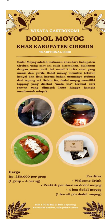
Figure 7. Gastronomy Travel Brochure for Dodol Moyog

Gastronomy Travel Brochure for Dodol Moyog.