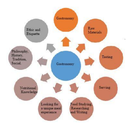
Figure 2. Gastronomic Components

Gastronomy itself presents a different way of serving and enjoying food or drink that makes it appear that there are unique things contained in a food or drink in a tourist destination, giving rise to a new experience for tourists who do it.