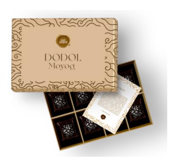
Figure 6. Kraft Carton Packaging

The following is the recommended packaging for dodol moyog manufacturers, the packaging is made of kraft carton with a size of 24cm x 8cm x 12cm. The kraft carton and clear wrapping materials for dodol moyog were chosen because dodol moyog is a food that is heavily coated with coconut oil, so using the thick packaging is considered safer and more practical for long trips. In addition, packaging made of kraft cardboard has the advantage of being environmentally friendly and recyclable.