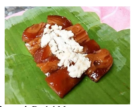
Figure 4. Dodol Moyog

mata ula or blondo topping. This snack has a sweet taste combined with savory from the mata ula. The texture and shape of the typical dodol moyog is still the same from ancient times until now because it is passed down from generation to generation and maintains its original shape.