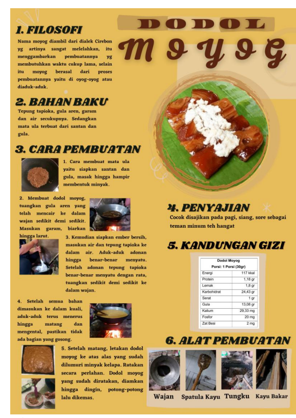
Figure 8. Infographics of Dodol Moyog