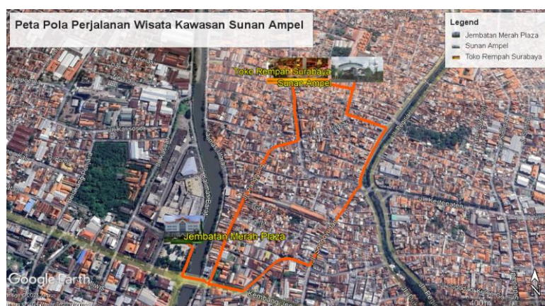
Figure 3. The Ampel Heritage Walking Tour

Jembatan Merah Plaza is the first wholesale mall in Surabaya which is located on Jalan Taman Jayengrono No.2, Krembangan Sel., Kec. Krembangan, The history of JMP, which is usually called this Mall, is quite interesting because in the Red Bridge monument area which was built since the VOC era, various kinds of goods are sold in this Mall wholesale, the most popular among tourists visiting this Mall are the batik and fabric outlets sold wholesale. The Ampel Heritage Walking Tour travel pattern can be seen in Figure 4.