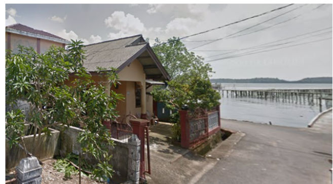
Figure 3. The effort community adaptation based on building constructions.

The field observation showed that the effort of the community adapts to geographical problems based on building constructions. We