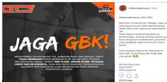
Figure 3. The example of Jakmania's official account that also written and spreading the campaign from social media.

The command from the center or the leader, always written and shown on the Jakmania official Instagram accounts, that known as InfokomJakmania. The message also containing the campaign, and always disenchant the followers to doing the same action. This picture becomes the prove that Jakmania also starts spreading the campaign from their own social media, not just asking the followers to make their own content.